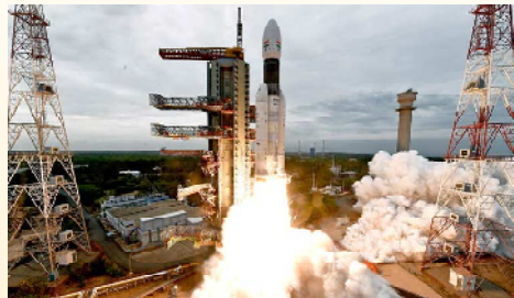
Agnikul, Dhruva Space and Kawa Space.

"This collective and unified effort of the ISPA should propel the ecosystem to accelerate and grow the space industry in India, including startups, MSMEs and academia. We have many challenges ahead but our efforts, including ISRO, in-space and ISPA, should be to take solid action and support large scale development of enterprises, strengthen technology and research and promote commercial space, ensuring sustained development of key components and exhibition activities," Sivan added.