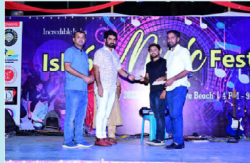
3rd prize- Singing Competition