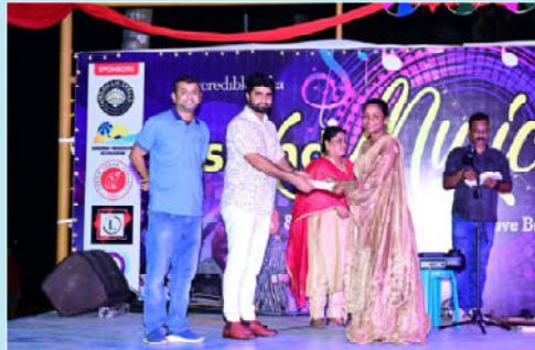
2nd prize- Singing Competition