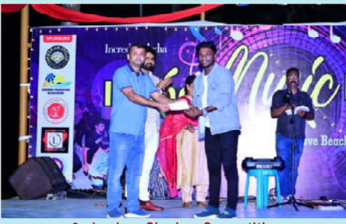
2nd prize- Singing Competition

delicious snacks and eatables also attracted the visitors. The music festival also featured dance and karaoke song dedication.