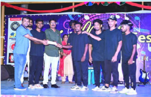
1st prize- Dance Competition