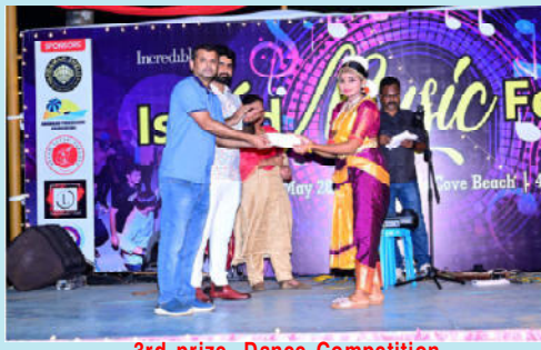
3rd prize- Dance Competition