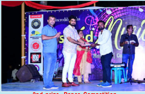
2nd prize- Dance Competition