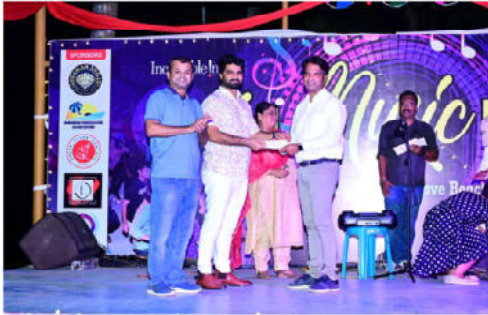
1st prize- Singing Competition