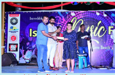
1st prize- Singing Competition