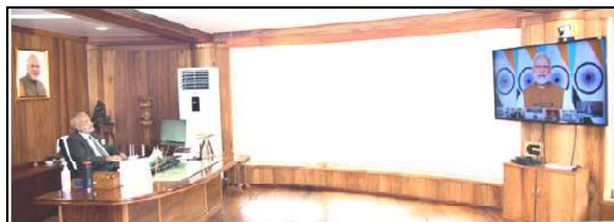
Admiral D K Joshi, PVSM, AVSM, YSM, NM, VSM (Retd.), the Lt Governor, A&N Islands and Vice-Chairman, Islands Development Agency participated in virtual launch of Digital Banking Units by the Prime Minister of India, Shri Narendra Modi dedicating 75 DBUs located in 75 Districts across Nation, including SBI, Mohanpura at Port Blair in A&N Islands to commemorate the 75 Years of Independence.