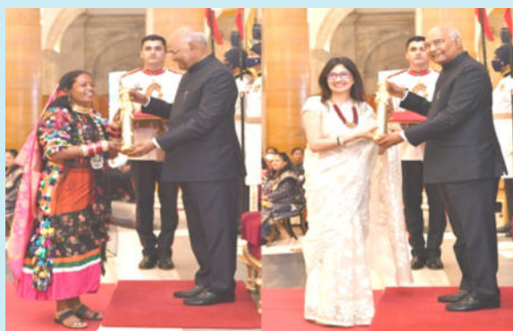
Women and Child Development Minister, Shri. Nirmala Sitharaman, confers Nari Shakti Puraskar on a woman achiever.

President, Shri Ram Nath Kovind conferred the Nari Shakti Puraskar 2020 and 2021 at a special ceremony held at Rashtrapati Bhavan on the occasion of International Women's Day today. The award was conferred on 29 outstanding and exceptional women achievers in recognition of their exceptional work towards empowerment of women, especially the marginalised and vulnerable.