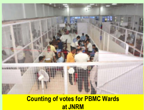
Counting of votes for PBMC Wards at JNRM

The counting of votes for PBMC & Panchayat started at around 8 am amidst tight security arrangements under the close supervision and monitoring of Director (Panchayat & Municipal Elections), Shri