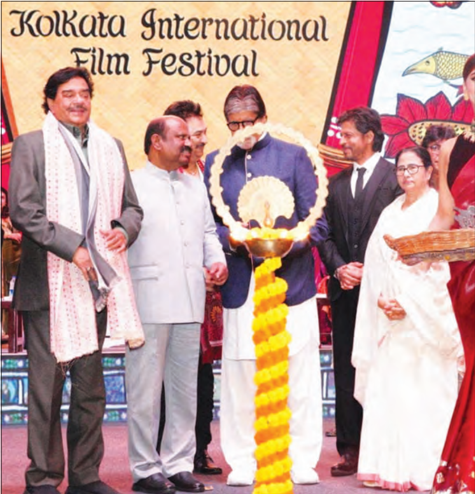
Amitabh Bachchan lighting the ceremonial lamp to inaugurate the 28th edition of Kolkata International Film Festival at Netaji Indoor Stadium. Chief Minister Mamata Banerjee, Governor CV Ananda Bose, TMC MP Shatrughna Sinha and Shahrukh Khan are also seen