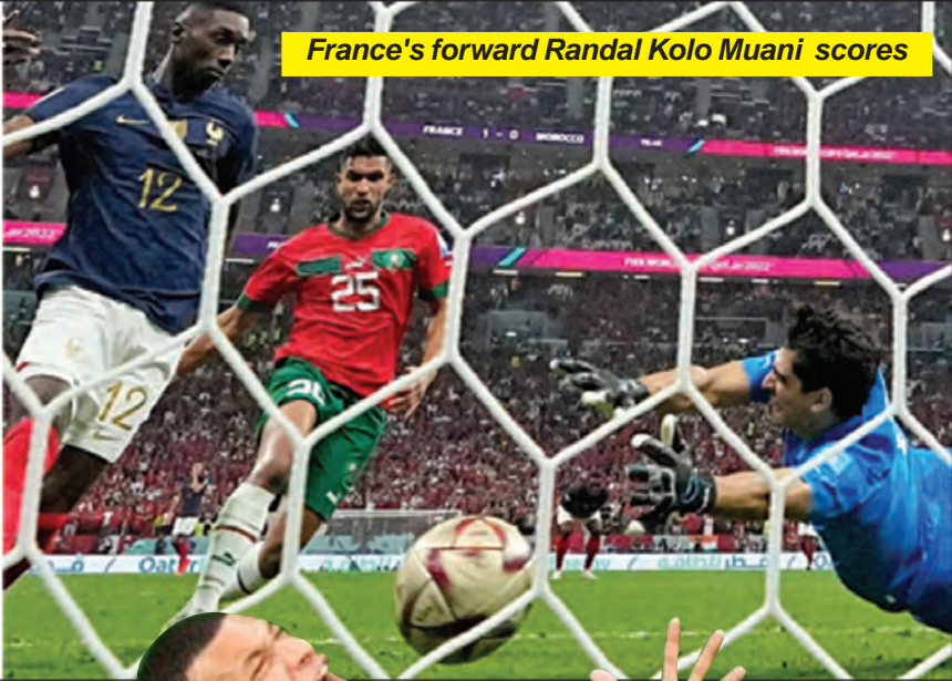
France's forward Randal Kolo Muani scores