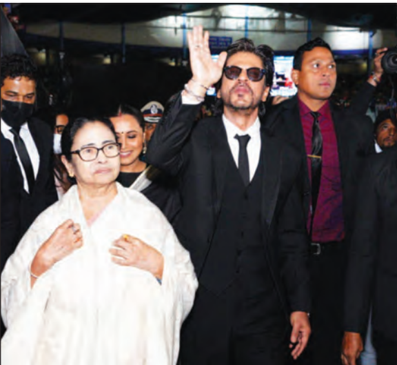
Shahrukh Khan waves at audience as he enters Netaji Indoor Stadium with Chief Minister Mamata Banerjee to attend the inauguration ceremony of KIFF

KOLKATA, DEC 15 /--/ Legendary actor Amitabh Bachchan on Thursday while tracing the history of Indian cinema, described the current brand of historical movies as couched in fictionalised jingoism. Bachchan in a speech at the 28th Kolkata International Film Festival which he declared open, pointed out that the Indian film industry has always propagated courage and managed to keep an egalitarian spirit alive. "Since early times there have been many changes in cinema content ... from mythological films and socialist cinema to the advent of the angry young man ... to the current brand of historicals, couched in fictionalised jingoism, along with moral policing," the Octogenarian superstar of Indian cinema said. He added: "The range has kept audiences reflecting on the politics and social concerns" of the times. The actor also pointed out that