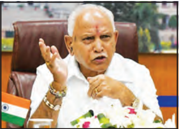
B S Yediyurappa

said there is no need for people to invite him as it is his duty to attend party programmes. Asked if he was not willing to go there because he got an invitation at the last minute, Yediyurappa said: "There is no truth in it. I was not in a position yesterday to go there. Because there was a pressure to attend the event, I decided to participate". When asked whether there was any attempt to finish him off politically, the party veteran said, "There is no truth in it. No one can finish off anyone. I have my own strength. I have strengthened the party and toiled to bring BJP to power. The entire state knows this." He said everyone knows that he was among