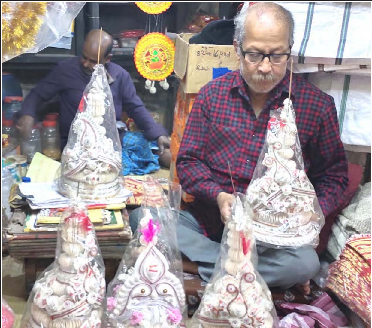
Bride and bridegrooms traditional crowns being sold during marriage season at Chitpur market in Kolkata on Thursday

The second reason why the current inflation is not extraneous to neo-liberal capitalism is the following. Capitalist crises have this characteristic that attempts to resolve them often simply lead to crises in a different form. The tendency towards over-production that neo-liberal capitalism has generated because of the rise in the share of surplus in output in the world capitalist economy as a whole, as well as in individual capitalist economies, has been sought to be overcome for a long time in the US, the leading metropolitan country, by keeping interest rates close to zero and pumping in huge amounts of liquidity into the economy through what is called "quantitative easing". (IPA Service)