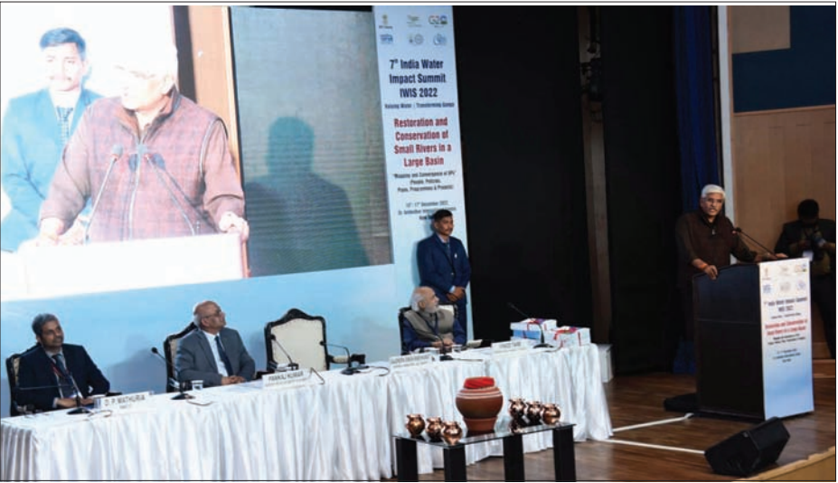
Union Minister for Jal Shakti, Gajendra Singh Shekhawat addressing the audience at the 7th edition of the India Water Impact Summit (IWIS), in New Delhi