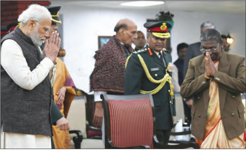
President Droupadi Murmu and Prime Minister Narendra Modi gesture to each other at Vijay Diwas Reception, in New Delhi on Thursday