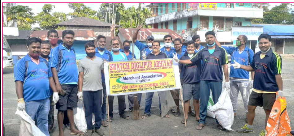
Merchant Association of Diglipur conducted Swatch Diglipur Abhiyan in Diglipur on 3rd October, 2021

Concrete step needs to be taken by the administration to tackle mental health issues of students, before things go out of hand.