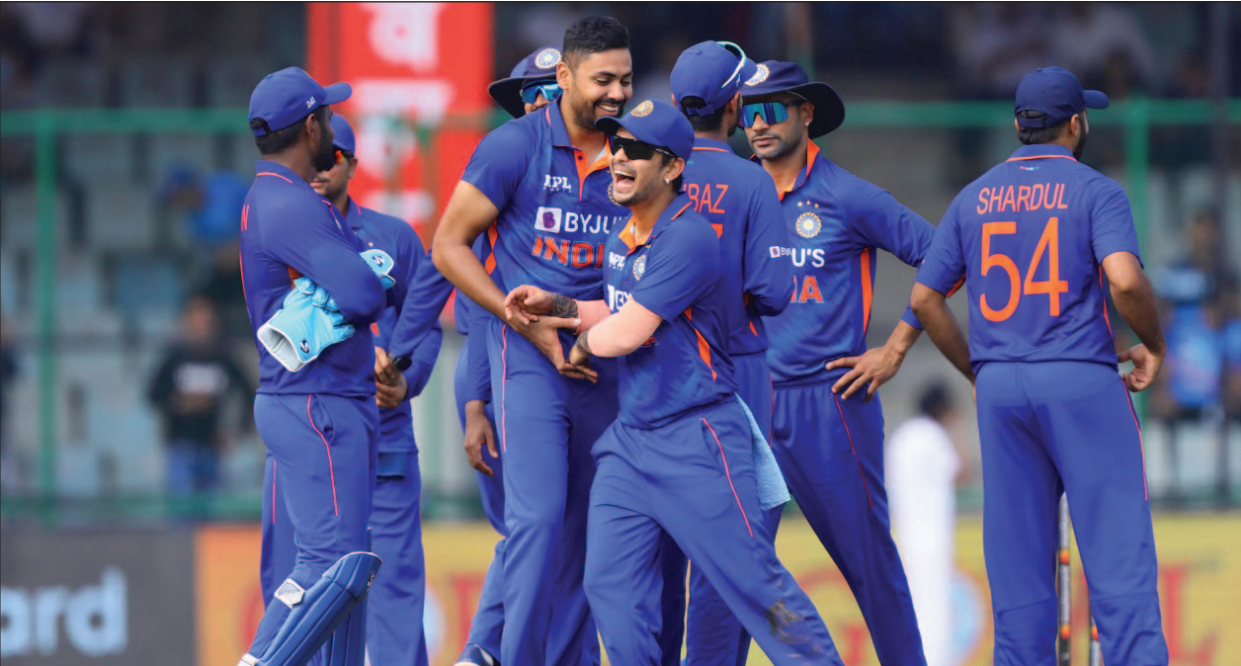
Indian squad celebrating a dismissal during third ODI with South Africa at Arun Jaitley Stadium in New Delhi on Tuesday.