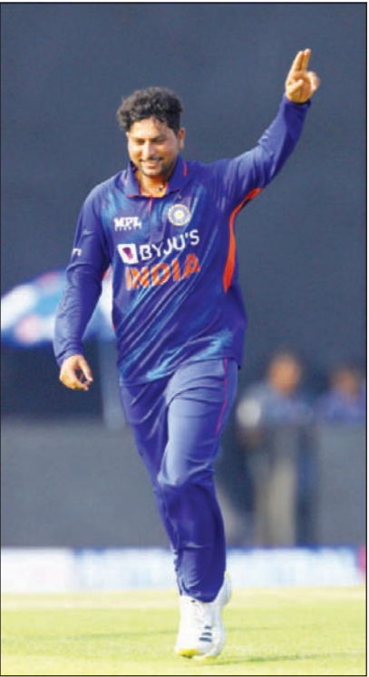
Kuldeep Yadav celebrating a dismissal during third ODI with South Africa at Arun Jaitley Stadium in New Delhi on Tuesday

sixes including a match-winning maximum to steer India to victory after Gill was trapped leg before with three runs needed. Earlier put in to bat, South African batters failed to impress, falling like ninepins. Quinton