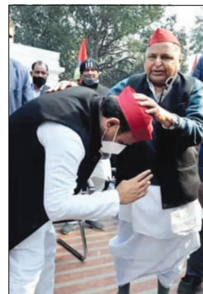
Mulayam Singh with son and SP leader Akhilesh Yadav—File photo

SAIFAI, OCT 11 /--/ As people thronged the funeral of Mulayam Singh Yadav on Thursday, the socialist leader's connect with the common man was apparent. Almost every one had a story to tell: How they first got introduced to 'Netaji', or how humble and accessible he was even after he became a heavyweight in Indian politics. Some recalled how, as a chief minister, Yadav would have his car pulled over to interact with villagers grazing their cattle in open fields, while many others thanked him for getting an inter-college