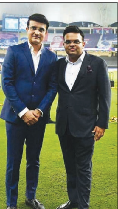
Sourav and Jay Shah