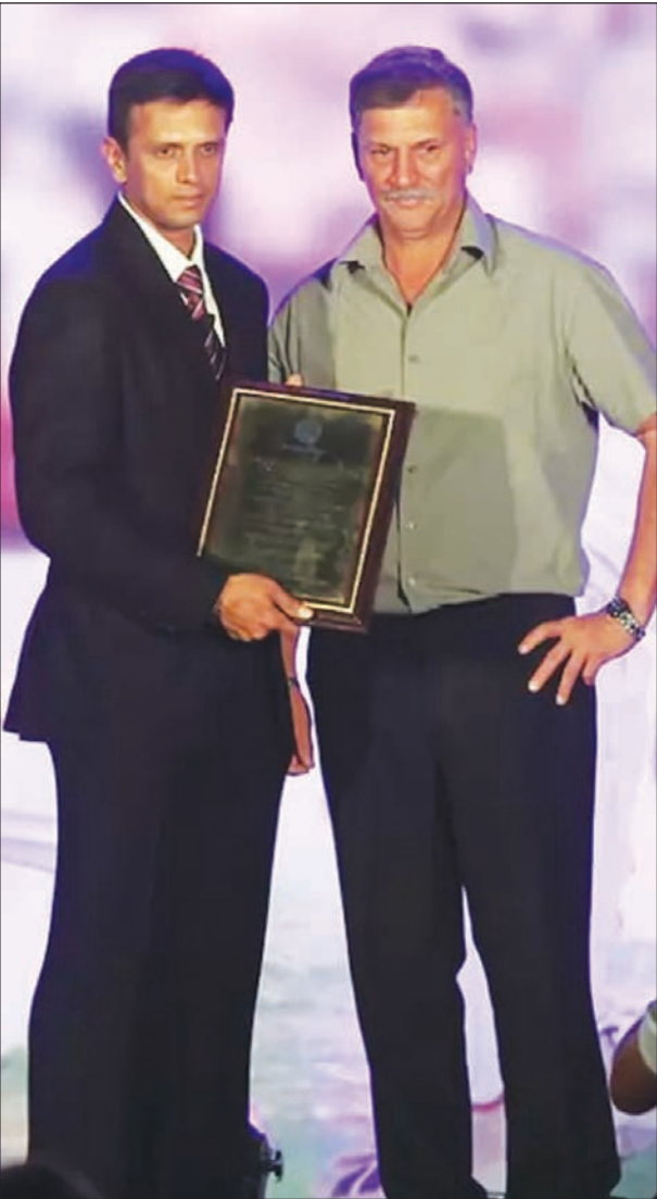
In this file photo former cricketer Roger Binny with Indian cricket team Head Coach Rahul Dravid in Bengaluru. Binny is likely to replace Sourav Ganguly as the BCCI President when the Board will hold its Annual General Meeting (AGM) on Oct. 18, according to the cricket body's sources