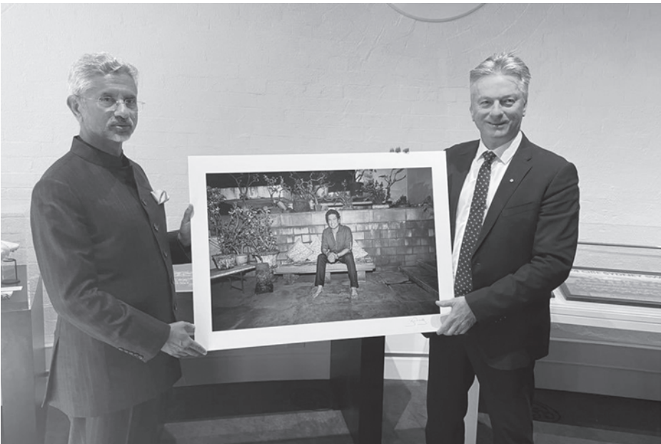
External Affairs Minister S Jaishankar with Australian cricketer Steve Waugh during a meeting, in Sydney