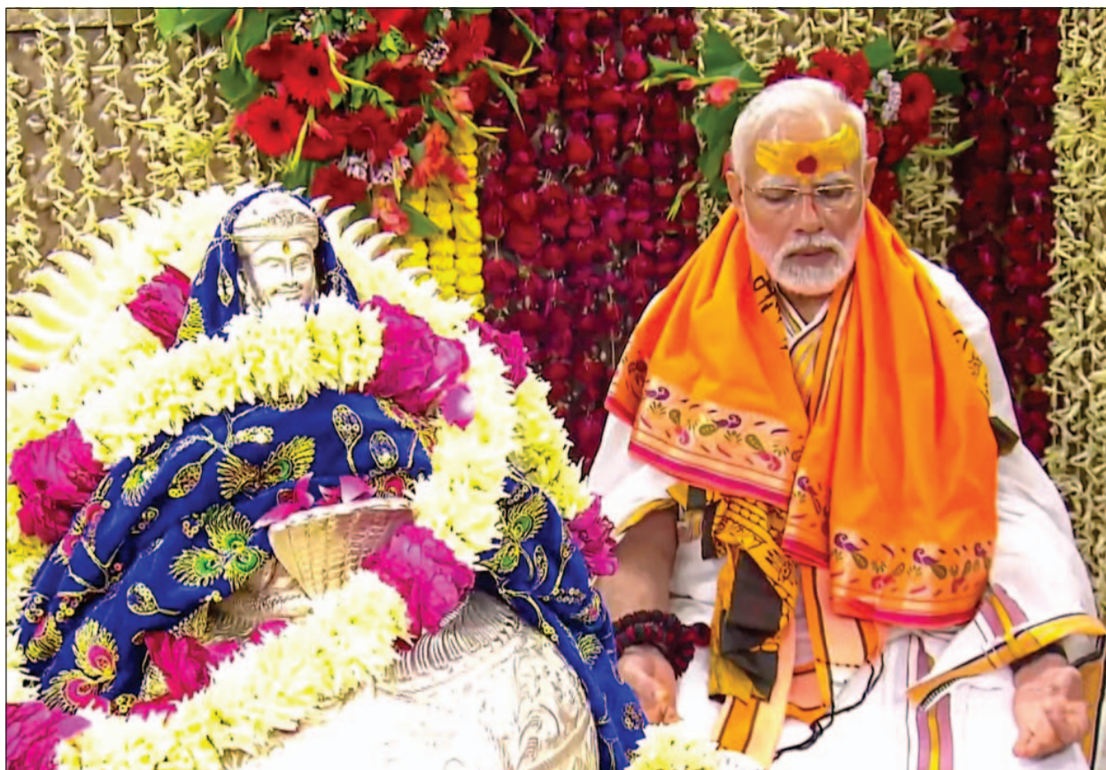
Prime Minister Narendra Modi Offering prayers at Shri Mahakaleshwar temple in Ujjain on Tuesday