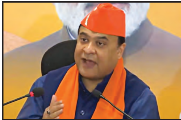
Assam Chief Minister Himanta Biswa Sarma