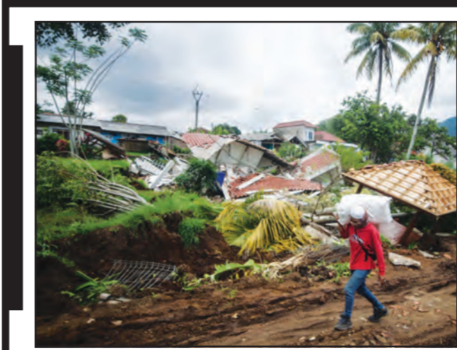
Volunteers deliver aid to villagers after a 5.6-magnitude earthquake in Cianjur, West Java, Indonesia

observed to have a "pox-like" disease, although they are not thought to be the disease's animal reservoir. Although the WHO has named numerous new diseases shortly after they emerged, including Severe Acute Respiratory Syndrome or SARS and Covid-19, this appears to be the first time the agency has attempted to rechristen a disease decades after it was first named. Numerous other diseases, including Japanese encephalitis, German measles, Marburg virus and Middle Eastern Respiratory Syndrome have been named after geographic regions, which could now be considered prejudicial. WHO has not suggested changing any of those names. (AP)