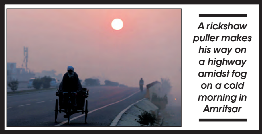
A rickshaw puller makes his way on a highway amidst fog on a cold morning in Amritsar