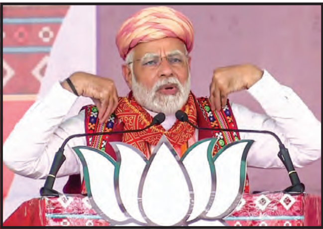
Prime Minister Narendra Modi addressing an election rally ahead of Gujarat assembly election at Palitana in Bhavnagar on Monday

he said. The Prime Minister said his government has taken a tough stand against such activities. "Armed forces now kill enemies after entering their territories. The BJP government has a zero-