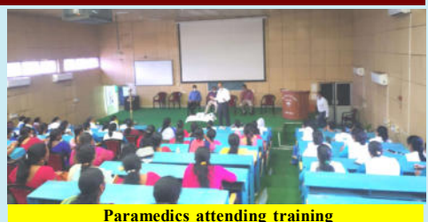
Paramedics attending training

Staff Reporter Port Blair, Mar. 4 In connection with the upcoming Panchayat & Municipal Election - 2022, 3- rounds of training have already been imparted to the Polling Officers/Officials appointed for the poll duties in P BMC & Panchayat of Port Blair & Ferrargunj Tehsils. In order to further fine tune the poling officials, a doubt