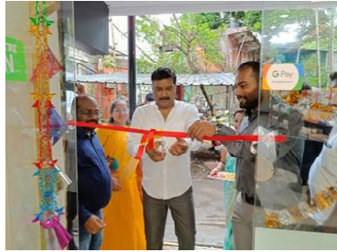
Annai Agency, Junglighat, Port Blair, South Andaman.

Port Blair, Oct 17: 'Little Andaman' opened its doors for the first time on 17th June. The event started at 09 AM. The Member of Parliament Mr. Kuldeep Rai Sharma inaugurated the show room by cutting ribbon. The new showroom is located near