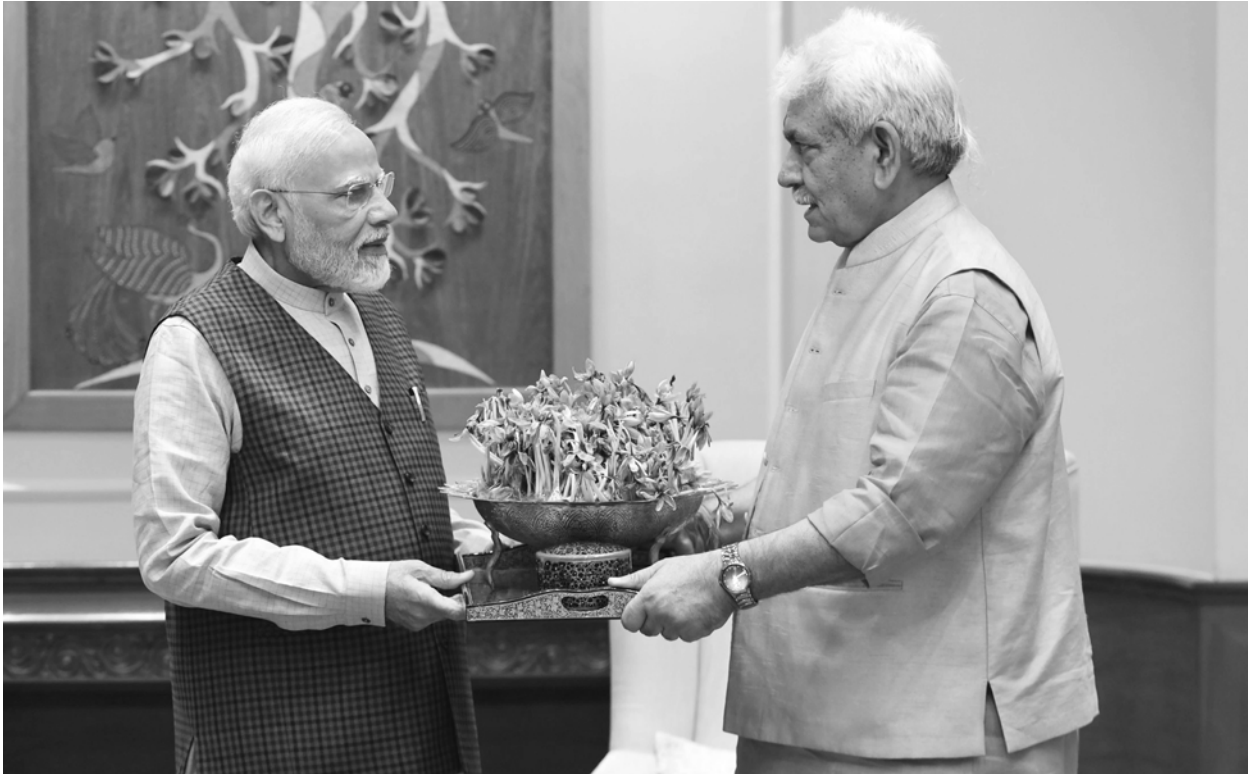
Prime Minister Narendra Modi with Lt. Governor of Jammu and Kashmir Manoj Sinha during a meeting, in New Delhi on Sunday