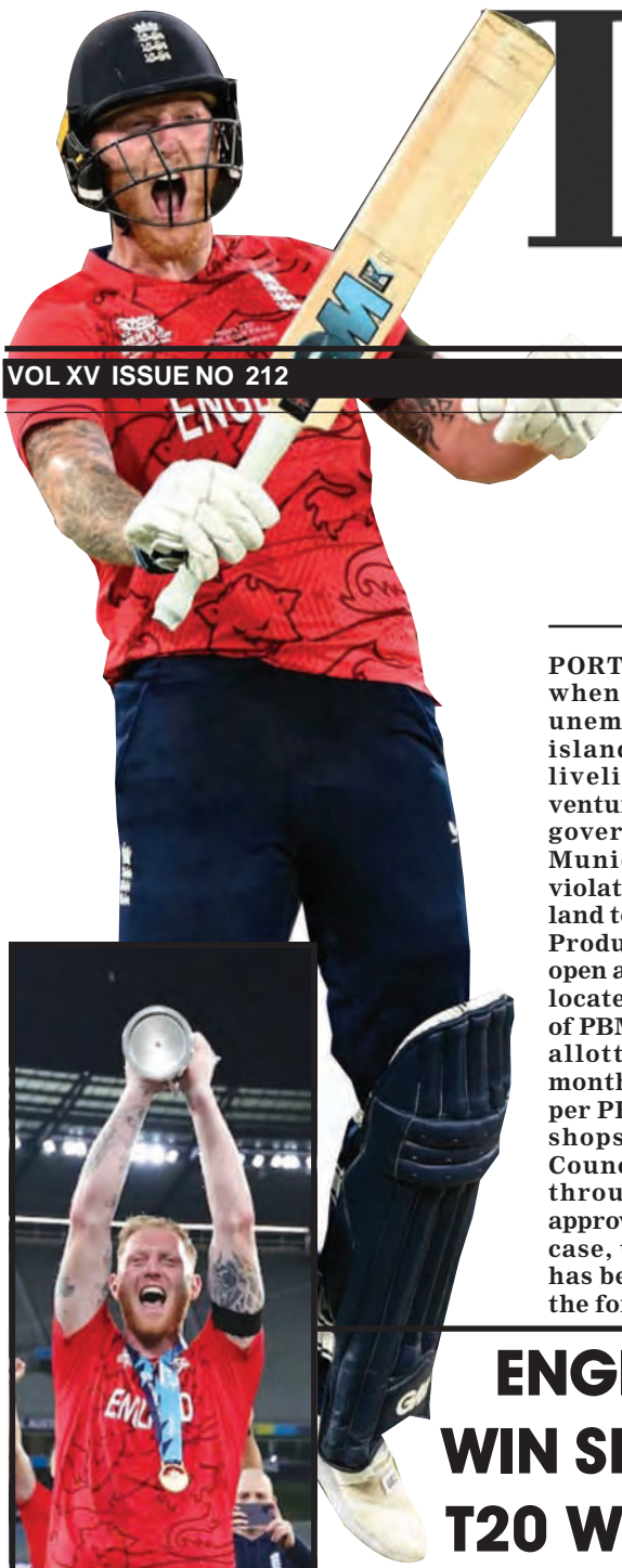
Ben Stokes was one of England's leading men on the day

In Today's Papers... ■ Transforming Jammu by introspecting beyond partisan agendas – Page-3 ■ Priyanka Gandhi posed questions on Rajiv's assassination: Nalini Sriharan Page-6