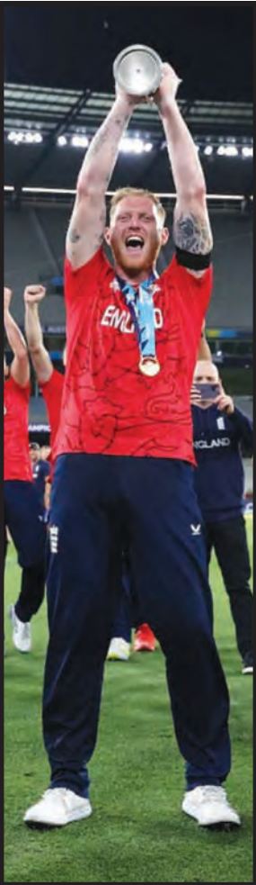
Ben Stokes was one of England's leading men on the day

tournament including in the final. "Huge swing in the game, that was a fantastic over from Adil. He has been outstanding for us in the last three games, just the guy who makes things happen and his performance was outstanding," the England skipper said. "And that man again, Ben Stokes is there at the end. He is the ultimate competitor in anything he does and has the experience to bank on as well. He timed it perfectly, the impetus that he and Moeen Ali had just took it away from Pakistan." It was a rollercoaster campaign for Pakistan who made a dramatic comeback after losing their first two games to India and Zimbabwe. The Netherlands helped them immensely by winning their final league game to knock South Africa out of the World Cup. "Congratulations to England, they deserve to be champions and fought well. We felt like home here, got great support at every venue. Yes, we lost the first two games but how we came in the last four games was incredible.