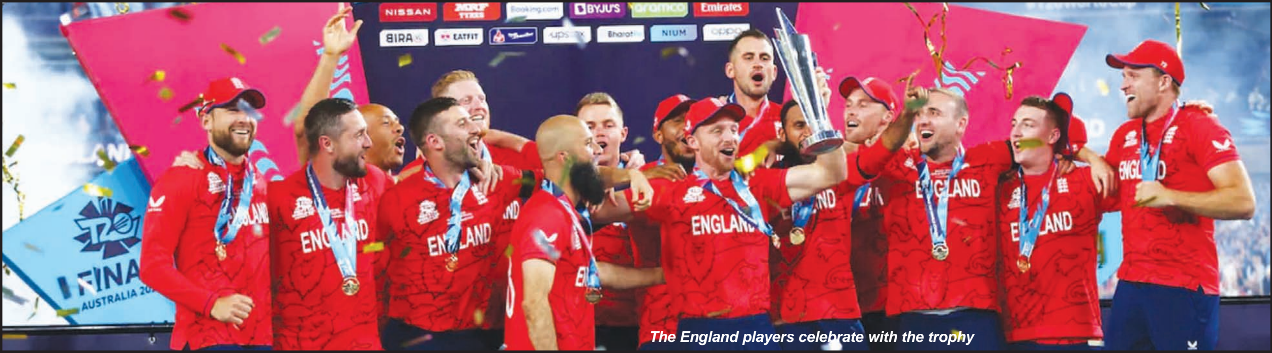
The England players celebrate with the trophy

Rashid spins a web to restrict Pakistan before ODI champions England take T20 crown too