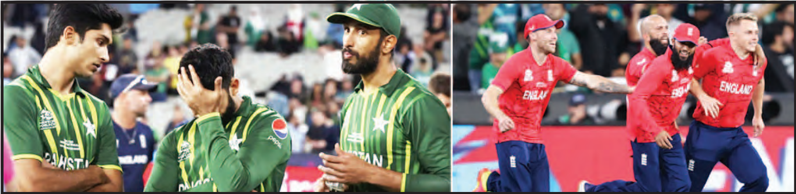
(Left to right) Mohammad Hasnain, Shadab Khan and Shan Masood are dejected after the defeat Sam Curran and Adil Rashid, who played key roles in England's win, lead the race out to the middle

year. Curran, England's most consistent bowler in the tournament, angled one across at fuller length and Rizwan didn't have enough width to drive as he dragged that back to the stumps. Babar hit a couple of boundaries but as it has been for him generally, it was more of a struggle to keep the scoreboard alive. At the start of the back-10, when Jos Buttler introduced Liam Livingstone to bowl his off-breaks, Shan got 14 runs with a down the ground boundary and a six. But Babar at the other end was foxed by Rashid as he shaped to play the cut and found a googly cramping him for room to give a return catch to the English leg-spinner of Pakistani descent. Iftikhar Ahmed (0) would like to forget the evening as he was kept under tight leash by Rashid and then Stokes bowled one in the channel to get a nick as Pakistan slumped to 85 for 4 in the 13th over. Shan built a launchpad for himself and threw it all away as Curran tested his patience with variations of cross seam deliveries and cutters. (PTI)