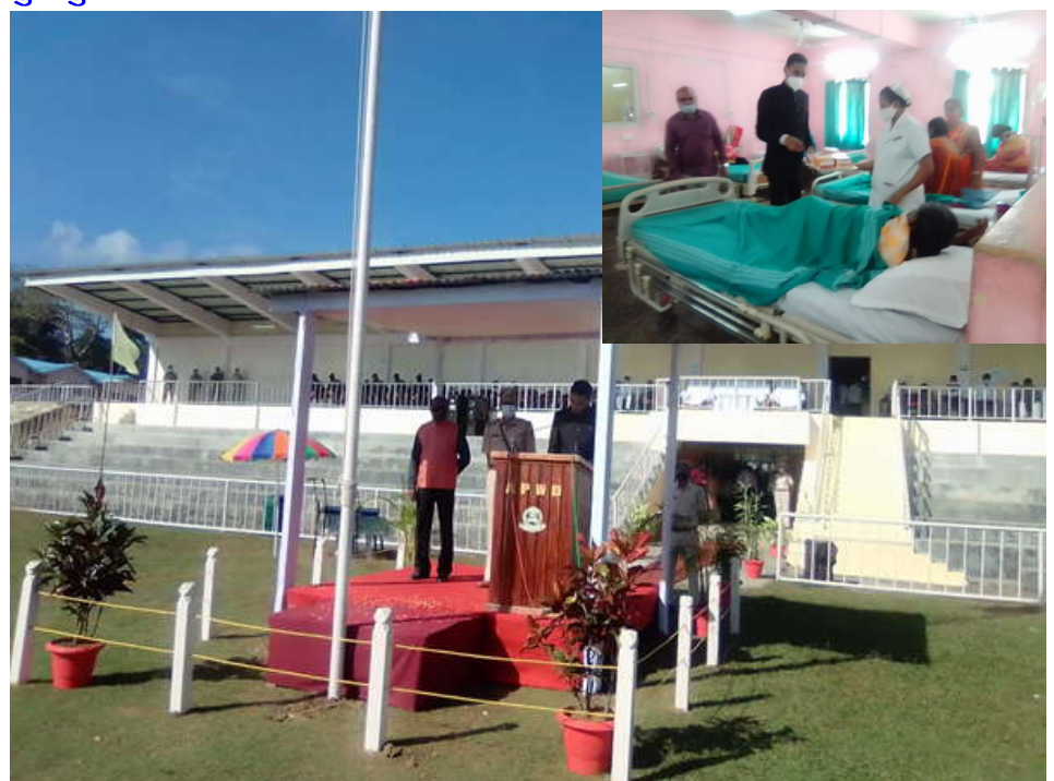
Assistant Commissioner of Diglipur distributed sweets to inpatients of CHC Diglipur after unfurling National flag at Diglipur Stadium on the occasion of 73rd Republic Day.

डिगली पूर पुलिस के द्वारा इस शातिर चोर को गिरफ्तार कर लिए जाने के बाद इस क्षेत्र में रहने वाले लोगो ने अपनी प्रतिक्रिया व्यक्त करते हुए डिगली पूर पुलिस के प्रति अपना आभार प्रकट किये है ।