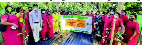
Port Blair, Dec 07: A demonstration programme on "Kitchen gardening in Urban and Peri-urban Spaces for Nutritional Security" was organized at ICAR-CAIRI, Port Blair as a part of "Azadi Ka Amrit Mahotsav" celebrations under

Port Blair, Dec 07: The Directorate in consultation with the District Administration has scheduled the sailing programme of the vessel MV Bharat Seema for Diglipur via Mayabunder on 09.12.2021 at 1700 Hrs from Haddo Wharf and will sail back to Port Blair on 10.12.2021 at 1400 Hrs from Diglipur via Mayabunder. Passenger tickets will be issued on 07.12.2021 from 0900 Hrs to 1300 Hrs at STARS Ticketing Counter, Phoenix Bay, Port Blair by following latest COVID 19 SOP in effect.