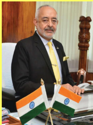
(Admiral D K Joshi)

I congratulate all the Islanders as well for the zeal and proactive participation in this noble cause which will go a long way in securing our islands from any major pandemic outbreak in near future.