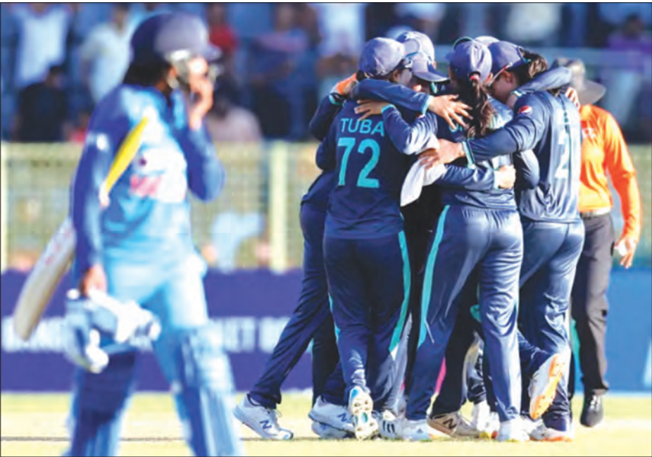
Pakistan celebrate after beating India in the Asia Cup match

SYLHET, OCT 7 /--/ Indian batters bungled badly in a straightforward chase as Pakistan recorded their first win over the arch-rivals in six years with a 13-run victory in the Women's Asia Cup, here on Friday. India, the most formidable team in Asia by some distance, batted poorly to be all out for 124 in 19.4 overs after Pakistan posted a modest 137 for six. Pakistan scripted a remarkable turnaround less than 24 hours after their shock loss over Thailand. At 65 for five, India were in all sorts of trouble with majority of the batters including star player Smriti Mandhana (17 off 19) throwing their wickets away. Prior this game, India enjoyed a 10-2 record over Pakistan whose previous win over the arch-rivals came way back in the 2016 T20 World Cup in New Delhi. Pooja Vastrakar got herself run out after attempting a run off a misfield while Dayalan Hemalatha (20 off 22) let her team down after not capitalising on a start. Questions were raised over Harmanpreet Kaur's fitness as she came into bat at number seven before