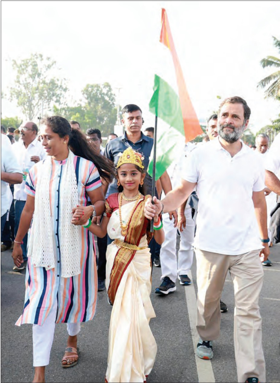
A girl dressed as Bharat Mata walks with Congress leader Rahul Gandhi during Bharat Jodo Yatra in Karnataka's Mandya, on Friday

Belarus' foreign ministry denounced the Nobel Committee for honouring Bialiatski, with the spokesman calling its choices in recent years so politicised that Alfred Nobel got tired of turning in his grave.