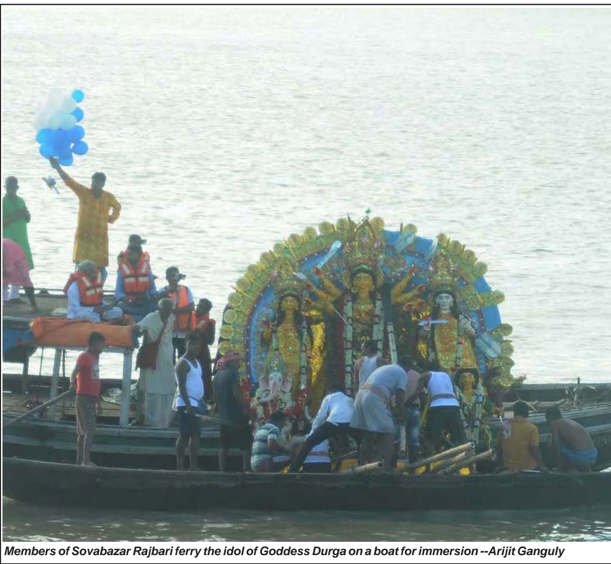
Members of Sovabazar Rajbari ferry the idol of Goddess Durga on a boat for immersion

"Through this Choupal Congress will talk to the people in the villages about how the rich-poor disparity and hatred between communities is increasing. Rural India is being exploited while Inflation is spiralling and the youths face increasing unemployment. The Congress will work through this campaign to bring people of all communities together" he said. (IPA)