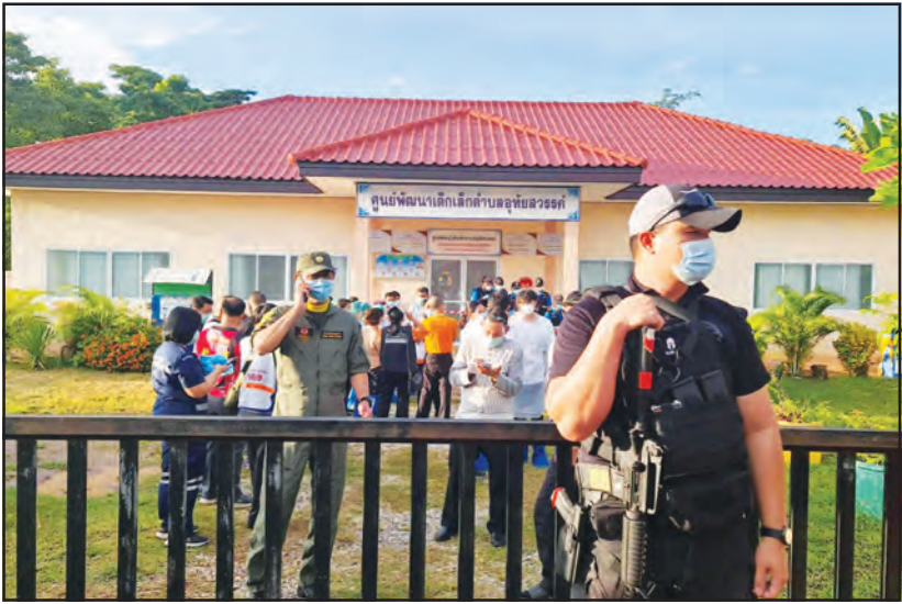
A police officer stands guard at the childcare center where a shooting took place in Nong Bua Lamphu province, Thailand

Last month, a clerk shot co-workers at Thailand's Army War College in Bangkok, killing two and wounding another before he was arrested.