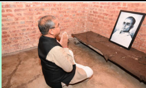
Minister paying tributes to Veer Savarkar at National Memorial Cellular Jail

Three positive cases have been detected, today of which, two were from incoming flight passengers who arrived here yesterday. Today, 12 flights with 1920 passengers arrived, out of which, 1619 passengers were vaccinated with both doses while RT-PCR test was conducted on 248 passengers and the reports are awaited. During RAT conducted on 40 passengers bound for North & Middle Andaman at Ferrargunj, no positive case has been detected. At Phoenix Bay Jetty, 65 passengers were tested with RAT, no positive case has been detected. RAT was conducted on 57 passengers at Mohanpura Bus Terminus, no positive case has been detected. At Helipad, RAT was conducted on 7 passengers, no positive case has been detected, a press release from Directorate of IP&T said.