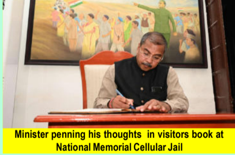
Minister penning his thoughts in visitors book at National Memorial Cellular Jail