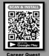
Career Quest Android App

Best RESULTS in Competitive Exams for the past 5 years