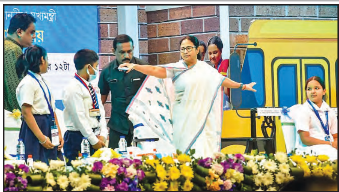
Chief Minister Mamata Banerjee with school students during a programme organised by West Bengal government on Children's Day, in Kolkata