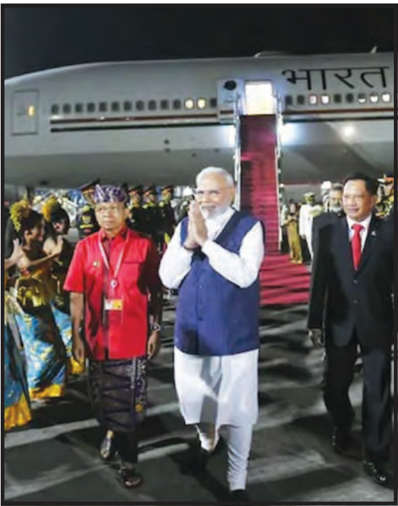
Prime Minister Narendra Modi gestures as he is being greeted in traditional style at the airport in Bali