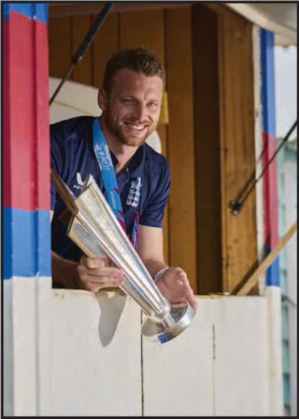
Jos Buttler poses for an official ICC photograph at Brighton Beach

Did he and another player of Pakistani descent, Moeen Ali, faced pressure from friends and family back home (British Pakistanis)? "Yes, it could be as back home we have got a lot of supporters, who have family history related to Pakistan. "Deep down both me and Moeen know we have got a lot of fans and friends who support our rivalry in a good way." The county from which Rashid hails, the Yorkshire CCC, has been one of the most notorious on the English county circuit and faced charges of institutional racism. (PTI)