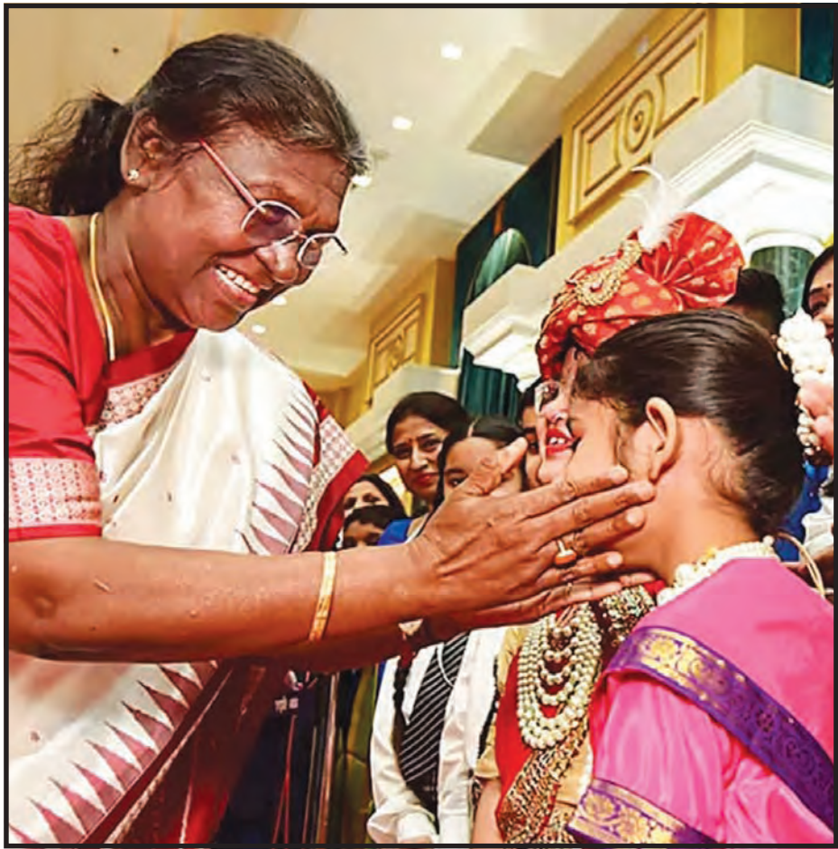
President Droupadi Murmu gives her caring touch to a girl student at an event attended by students of various schools, on the occasion of Children's Day at Rashtrapati Bhavan Cultural Centre (RBCC)