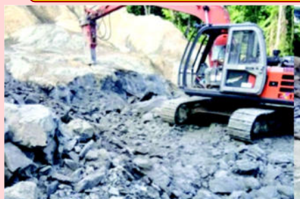
Pics show work in progress at upcoming Baratang Petrol pump

Dispensing Units with 4 nozzles. The sanctioned project cost for construction of Petrol Pump at Baratang is Rs. 2.89 crores while the project cost at Kadamtala is Rs. 2.44 crores.