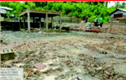
Photos show construction work of the new Petrol Pump coming up at Kadamtala in progress

As per the layout plan, the Baratang Petroleum Retail Outlet will have a storage capacity of 40 Kilolitre (20-20 each for Petrol) and 40 kilolitre (20-20 litre each for Diesel) having 3 dispensing units with 6 nozzles. Similarly, the Petroleum Retail Outlet at Kadamtala will have a storage capacity of 40 KL (20 KL each for Petrol and Diesel) having 2