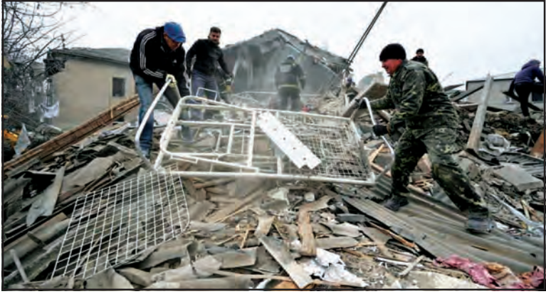
Rescuers work at the site of a maternity ward of a hospital destroyed by a Russian missile attack, as their attack on Ukraine continues, in Vilniansk, Zaporizhzhia region, Ukraine

First lady Olena Zelenska wrote on Twitter that a 2-day-old boy died in the strike and expressed her condolences. "Horrible pain. We will never forget and never forgive,"