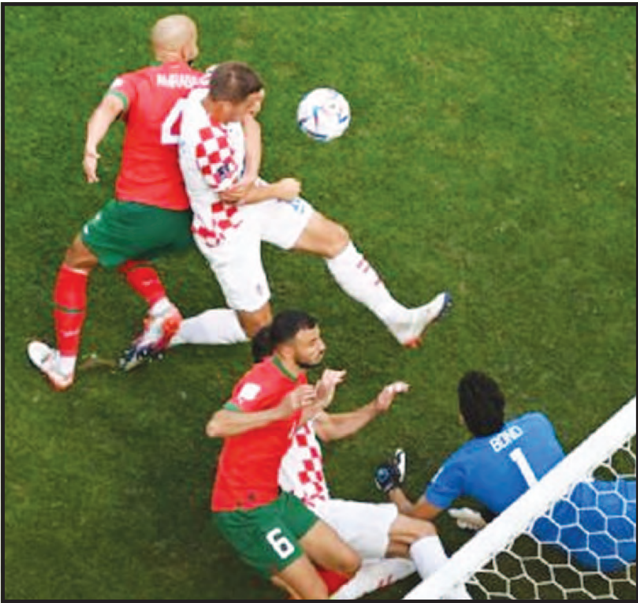
Croatia and Morocco could not breakthrough in front of goal

exercise caution following Saudi Arabia's shock win over Argentina, a result Morocco captain Romain Saiss said had "opened the door" for the tournament's less-fancied teams. Morocco took the game to a Croatia side featuring four players who started the 2018 final but struggled to create genuine chances against a defence marshalled by the experienced Dejan Lovren. Azzedine Ounahi strangely opted against shooting when well placed inside the area, with Hakim Ziyech and Achraf Hakimi heavily involved down the right without exerting undue pressure on Croatia. Ivan Perisic fired just over from distance for Croatia after intercepting a dreadful pass from Selim Amallah, while goalkeeper Yassine Bounou blocked well with his legs to deny Nikola Vlasic from close range. Modric, the former Ballon