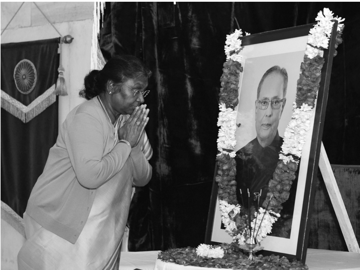
President Droupadi Murmu pays floral tributes to former President Pranab Mukherjee on his birth Anniversary, in New Delhi on Sunday

efficient and transparent. There are 25 high courts in the country. As on December 5, 778 judges are working in the high courts against the sanctioned strength of 1,108. On November 25, the government had asked the Supreme Court Collegium to reconsider 20 files related to appointment of high court judges. The government had expressed "strong reservations" about the recommended names. Out of the 20 cases, 11 were fresh cases and nine were reiterations made by the top court collegium. The government has returned all the names related to fresh appointments in various high courts on which it had "differences" with the Supreme Court Collegium, sources had said. (PTI)