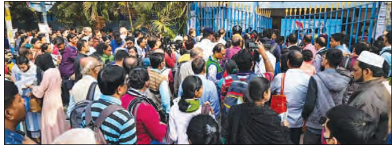
Candidates arrive to appear in West Bengal Primary Teacher Eligibility Test (TET) at an examination hall in Kolkata.