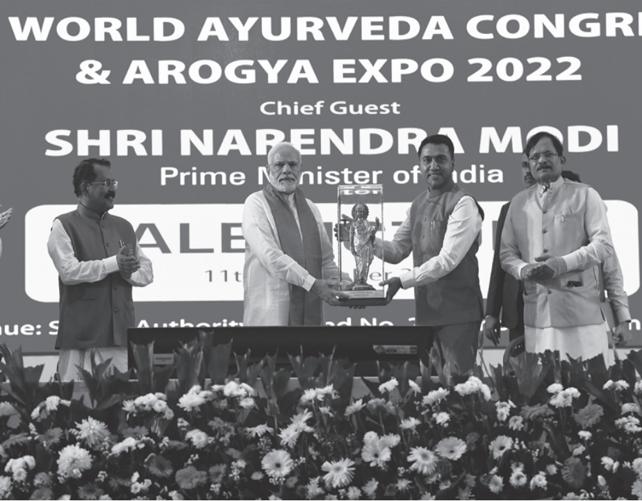
PM inaugurates three National Ayush Institutes at the valedictory function of 9th World Ayurveda Congress, in Goa