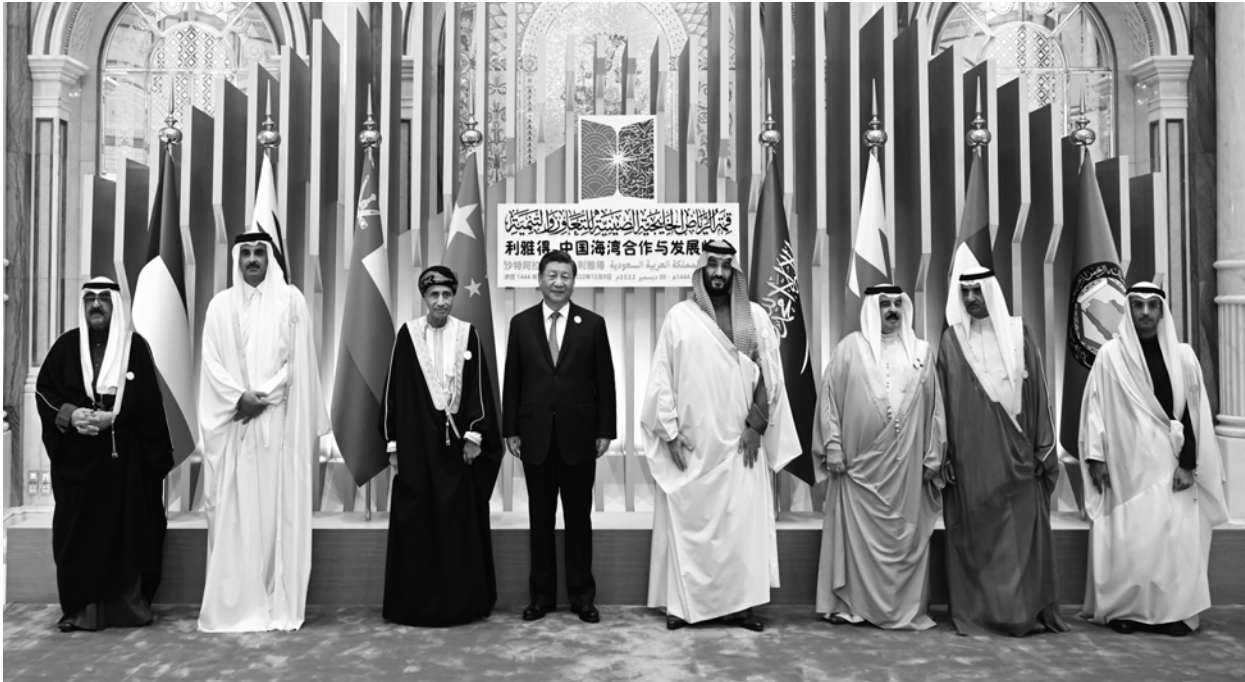
Chinese President Xi Jinping along with other top Arab leaders at the China GCC summit, in Riyadh

Further, Africa's home-grown terrorist groups have found ideological support from global terrorist groups such as Al-Qaida and ISIL. "The terrorist threat was further complicated by pirates and organised criminal networks facilitating trafficking in arms, drugs, humans and finance for these terrorist groups. The threat continues to grow towards the coastal region of Western Africa." (PTI)