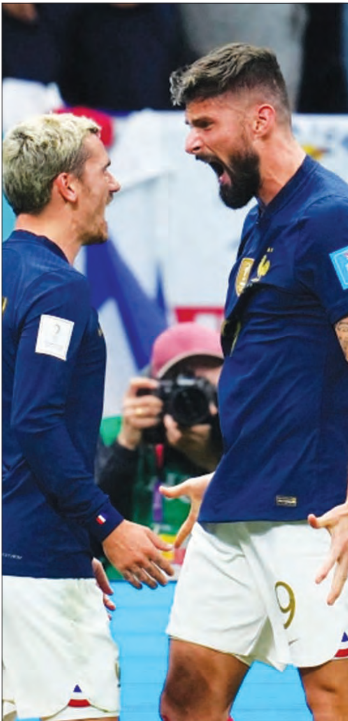
France's Olivier Giroud (right) celebrates with teammates Antoine Griezmann, left, and Jules Kounde after scoring the go-ahead goal in the 78th minute of their 2-1 victory over England in their World Cup quarterfinal at the Al Bayt Stadium in Al Khor, Qatar

CHATTOGRAM, DEC 11/--/ India captain Rohit Sharma was on Sunday ruled out of the first Test against Bangladesh, starting here on Wednesday, due to a thumb injury. Rohit had gone back to India after hurting his left thumb while fielding in the second ODI against Bangladesh in Mirpur on December 7. KL Rahul will captain the side in Rohit's absence. Abhimanyu Easwaran has been named as Rohit's replacement. "India captain Rohit Sharma met with a specialist in Mumbai for his left thumb injury, which he sustained during the 2nd ODI against Bangladesh. He has been advised appropriate management for this injury and will not be available for the first Test against Bangladesh," the BCCI said in a statement. (PTI)