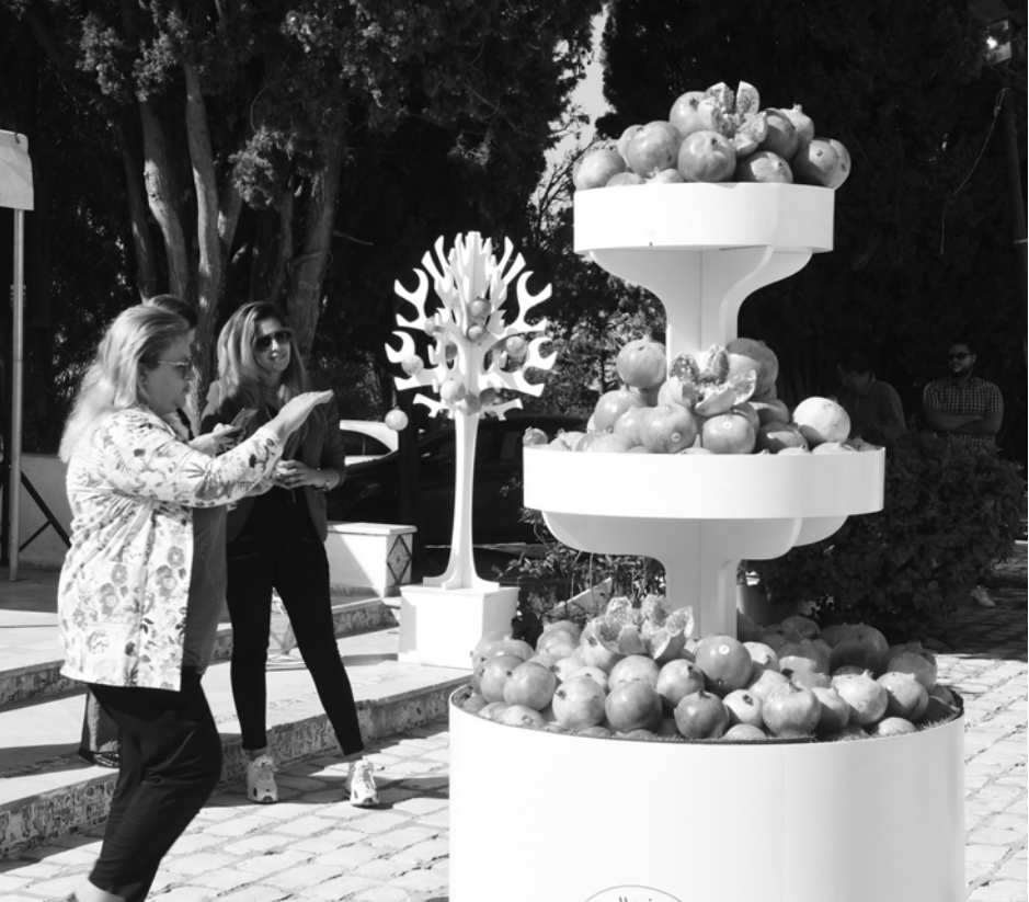
People look at pomegranates during a "pomegranate week" event showcasing harvested pomegranates and food made from pomegranates in Sidi Bou Said, north of Tunis