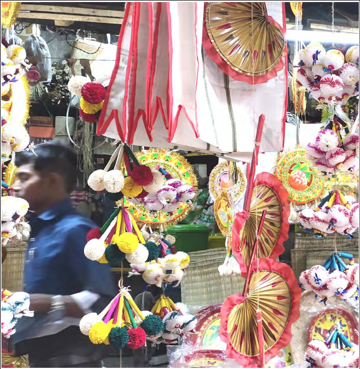
Household items being sold at a vendor’s kiosk in North Kolkata--Arijit Ganguly