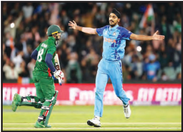
Arshdeep Singh was happy to have finished off the game

ADELAIDE, NOV 2 /--/ India captain Rohit Sharma on Wednesday said the team has prepared young Arshdeep Singh for death overs, something that worked for them in the absence of injured Jasprit Bumrah. According to the skipper, the choice was between Arshdeep and his senior pace colleague Mohammed Shami. The 23-year-old left-arm seamer delivered for India in the five-run win over Bangladesh in the T20 World Cup here, continuing his impressive run. Needing 20 off the last over, Arshdeep showed ice-cool temperament despite Nurul Hasan hitting him for a six and a four and bowled a couple of perfect yorker length deliveries to seal the tie for India. "Arshdeep, when he came into the scene, we asked him to do the death overs for us. With Bumrah not there, it was a tough job for someone to take up. For a young guy to come and do that kind of a job is not easy, we've prepared him," Rohit said at the post-match presentation ceremony. "He's been doing it for 8-9 months. I had to back someone who had been doing it regularly, it was a choice between Shami and Arshdeep." Having posted 184 for 6, courtesy Virat Kohli (64 not out off 44) and KL Rahul (50 off 32), Litton Das (60 off 27 balls) got Bangladesh off to a flyer before rain interrupted play. Needing 151 in 16 overs as per the revised target after the brief spell of showers, Bangladesh managed 145 for 6 in the end. "I was calm and nervous at the same time, but it was