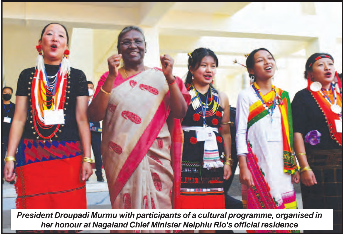
President Droupadi Murmu with participants of a cultural programme, organised in her honour at Nagaland Chief Minister Neiphiu Rio's official residence

KOHIMA, NOV 2 /--/ President Droupadi Murmu on Wednesday said that women empowerment will lead to uplift of the society. She virtually launched 75 projects at a public reception programme organised by the Nagaland government to mark her maiden two-day visit. Addressing a mammoth gathering, she said: "I am told that the literacy rate among women in Nagaland is the highest in the country and the state is the safest place in the country for women. This demonstrates the high respect accorded to women in the Naga society." Congratulating Phangnon Konyak on becoming the first woman Rajya Sabha MP from Nagaland, she urged women of the state to come forward and get more involved in public life.