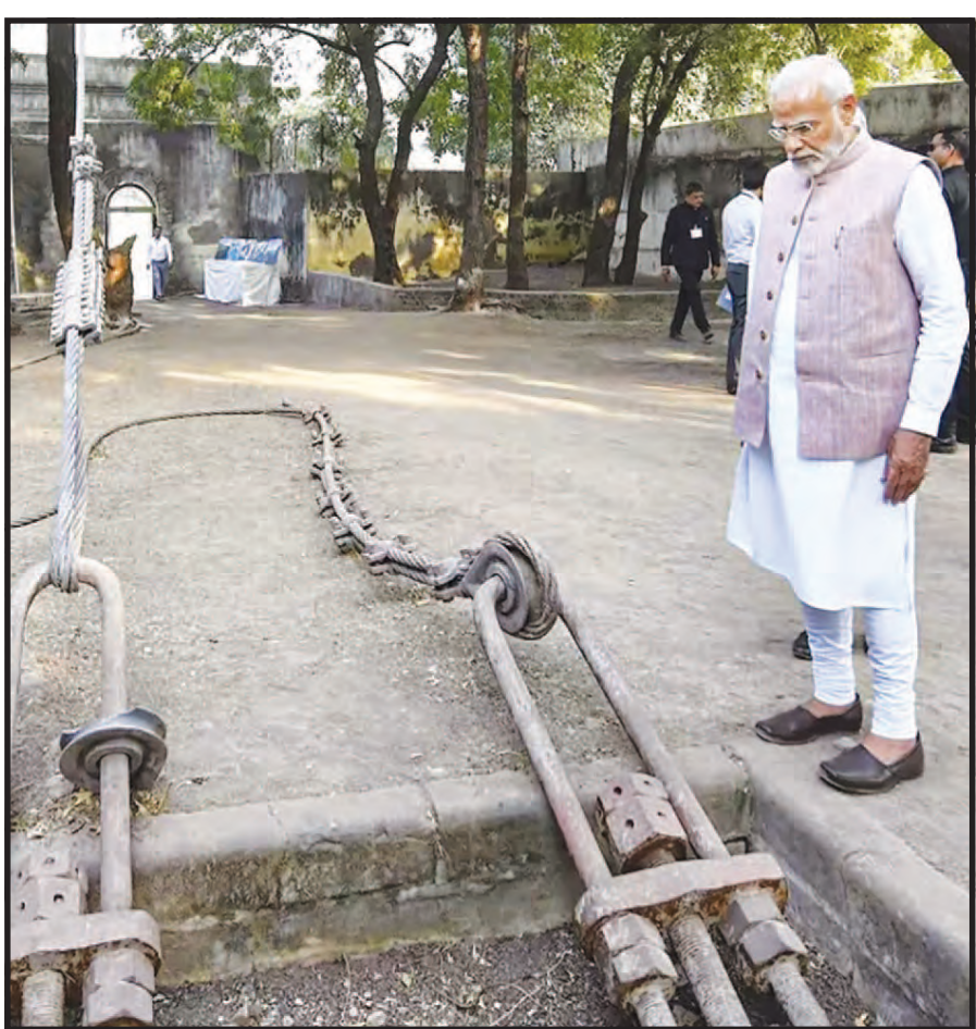
Prime Minister Narendra Modi at the site, where an old suspension bridge over the Machchhu river collapsed on Sunday evening, in Morbi district

environment minister Gopal Rai said the impact of air pollution was not limited to the national capital and the situation was equally bad in other National Capital Region (NCR) cities such as Ghaziabad (AQI 332), Noida (339), Gurugram (310), Greater Noida (336) and Faridabad (346). Rai appealed to city residents to preferably work from home or use shared transport to reduce vehicular emissions, a major contributor to air pollution in the national capital. The minister said the Delhi government will run a special drive at the 13 pollution hotspots in Delhi, including Narela, Anand Vihar, Mundka, Dwarka and Punjabi Bagh. "Fire tenders will be deployed at these places to sprinkle water," he said. (PTI)