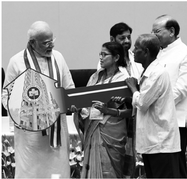
Prime Minister Narendra Modi handing over to a beneficiary, the key of their flat at the programme where he inaugurated 3024 such newly constructed flats for EWS

and urban affairs minister Hardeep Singh Puri were among those who attended the event.