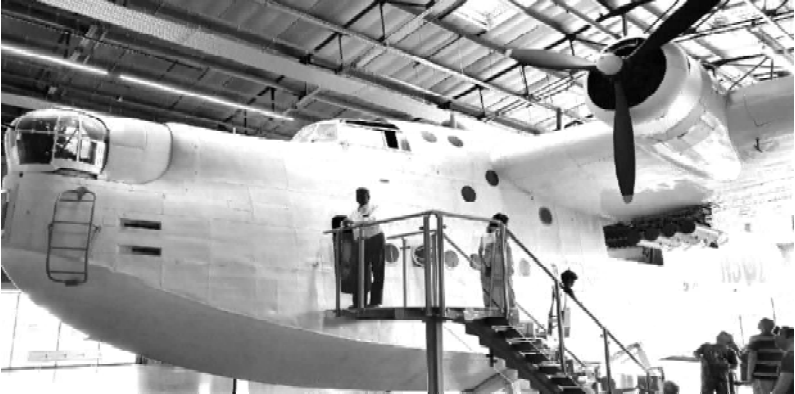
Similar type of Flying boat namely Short Sunderland flying boat which was successfully refurbished is now accessible to the public in Hangar 1 at the Royal Air Force Museum, London. (Retd. Asst. Director of Fisheries)

Since the war was looming in the area with Japanese advancement, the flying boat services disrupted with the fall of Singapore on 15 th march1942 and thereafter Port Blair was also captured by Japanese force on 23 rd march1942. The last flying boat to touch Port Blair were on 9 th and 10 th Feb.1942.Flying boat commanded by Capt. Gurney made its water landing at Port Blair harbour on 9 th Feb.'42 and at dawn on10 th Feb.'42 it departed for Singapore when another flying boat 'Clifton' commanded by Capt. Tapp reached Port Blair from Calcutta via Akyab (upper Burma) and Rangoon (lower Burma). Clifton was refuelled and tried to take off, but had engine power problem. After carrying out minor repair, left Port Blair on 11 th Feb. for Sibolga(Sumatra), remained overnight at Sibolga and left for Batavia(Java) from where it reached Broome (west coast of Australia). Though a number of Flying boats were destroyed during 2 nd World War which disrupted the long air connectivity from England to Australia. But their services were later utilized by holiday makers at Southampton (England) for flying to Isles of Scilly and Falmouth. Similarly, at Rose Bay (Australia), flying boats were quite popular amongst the holiday makers to visit Fiji Islands and New Caledonia. However, the growing popularity of advanced aircrafts and rising costs on maintaining aging flying boats, eventually forced the ending of Golden Era of Flying boats but leaving indelible memories of flying boats.