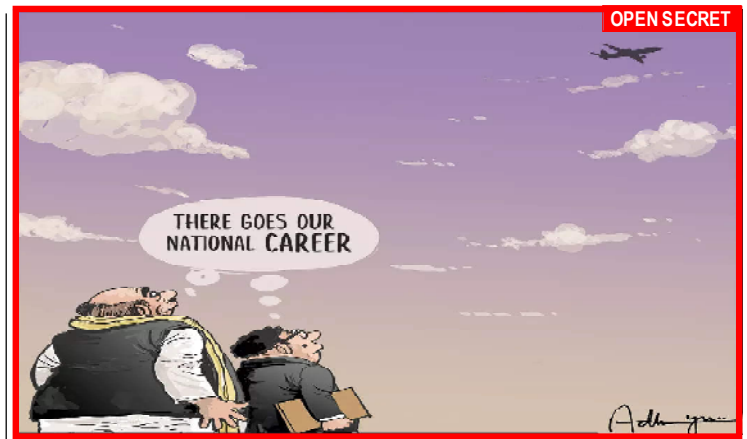
Eighteen persons from....