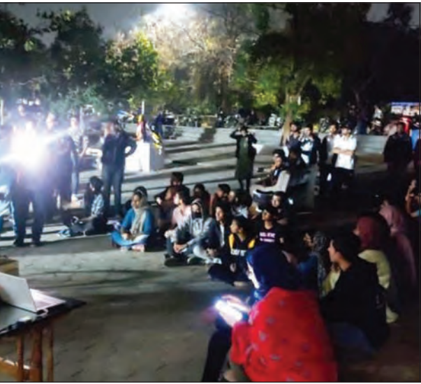
A group of students at Hyderabad Central University screening the BBC documentary inside the campus

THIRUVANANTHAPURAM, JAN 24 --/ The controversial BBC documentary on 2002 Gujarat riots when Prime Minister Narendra Modi helmed the western state was screened across Kerala on Tuesday by various political organisations including the pro-left Students Federation of India (SFI), as the BJP youth wing went up in arms protesting against the screening. BBC's 'India: The Modi Question' was screened in several parts of the state on Tuesday, prompting protest marches by the BJP's Yuva Morcha against the same. However, support came in for the BJP from unexpected quarters as senior Congress leader and former Kerala CM AK Antony's son, Anil, voiced displeasure against the documentary. Protest marches were taken out by Yuva Morcha to the Victoria College in Palakkad and Government Law College in Ernakulam where SFI followed through with its announcement to screen the documentary. In both places, police intervened to remove the protestors and prevent any conflict. DYFI, the youth wing of the ruling CPM in Kerala, said it will screen the documentary not just in the southern state, but across India. It has to be shown to the public irrespective of the attempts by the Union government to hide it, V K Sanoj, state secretary of the DYFI told reporters. He said there was nothing "anti-national" about screening the documentary as it has not been banned. DYFI has no interest in creating any