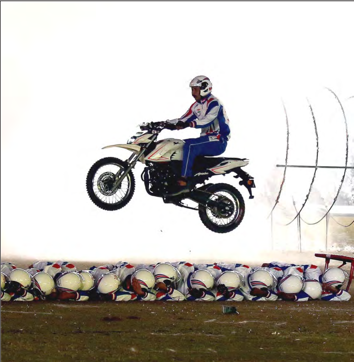
Glimpses of the first day of two day Military Tattoo & Tribal Dance Festival 'Aadi Shaurya - Parv Parakram ka' being held at Jawaharlal Nehru Stadium, in New Delhi

"Was an honour to meet Dr. @Dr S Jaishankar and discuss wide ranging issues. IN&LK have been long standing friends & Sri Lanka is truly grateful for the Indian govt's prompt financial assistance amounting to $4bn dollars in 2022 to mitigate the adverse effects