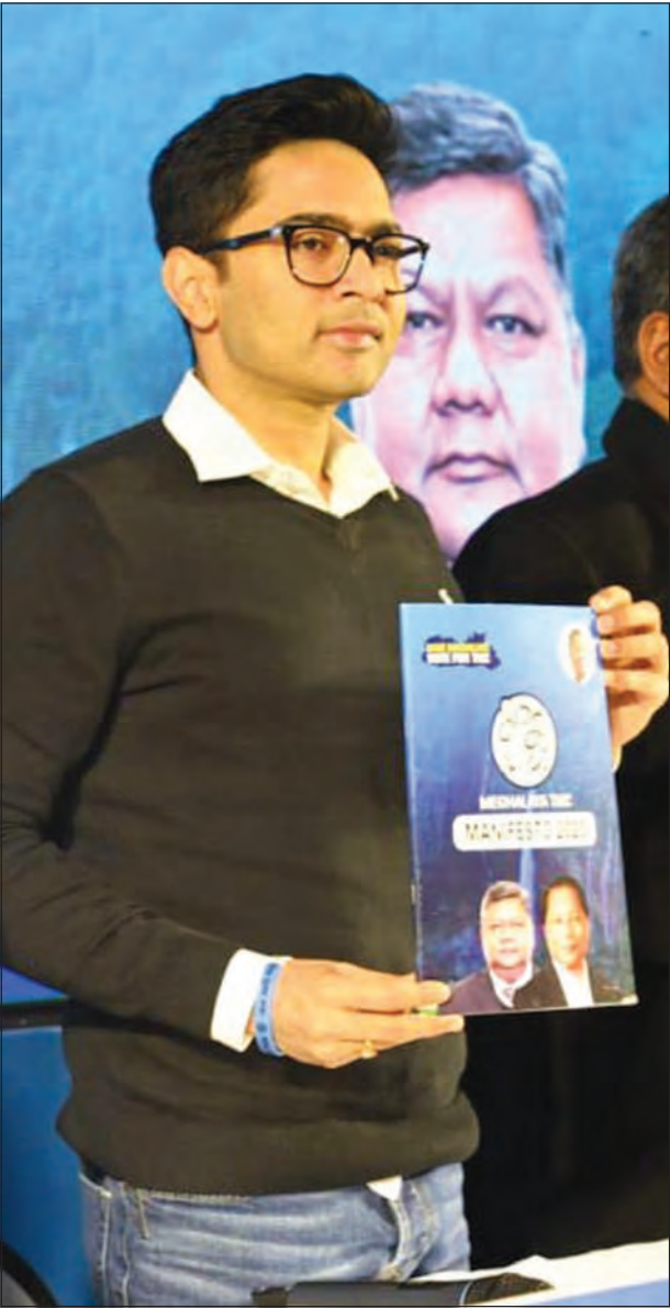
TMC national general secretary Abhishek Banerjee releasing party's manifesto for upcoming Meghalaya Assembly election, in Shillong on Tuesday