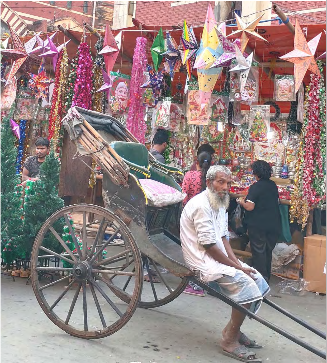
A hand pulled rickshaw driver waits for passengers in front of roadside stalls selling Christmas decorative items outside New Market in Kolkata on Tuesday--Arijit Ganguly