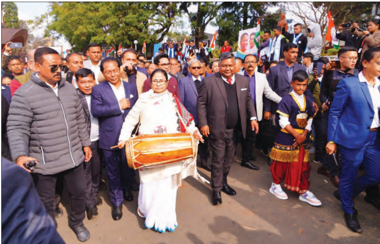
Chief Minister Mamata Banerjee trying her hands on dhol (traditional drum) as she reaches State Central Library for party workers' convention in Shillong. TMC national general secretary Avishek Banerjee is also seen