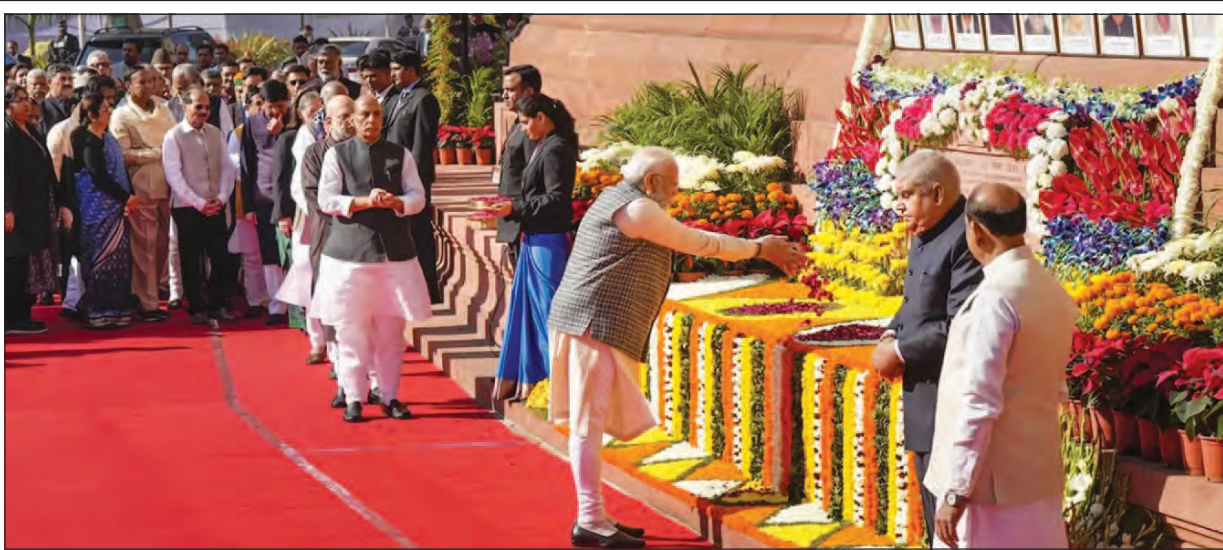
Prime Minister Narendra Modi pays homage to martyrs who lost their lives in the 2001 Parliament attack on its 21st anniversary, at Parliament House complex in New Delhi

Addressing reporters outside Parliament House, Shah also said the Congress had raised the border issue in Parliament to avoid questions on the Rajiv Gandhi Foundation's FCRA [Foreign Contribution (Regulation) Act] cancellation. The Rajiv Gandhi Foundation (RGF), he alleged, had got Rs 1.35 crore from the Chinese Embassy. Its registration was cancelled as this was not according to FCRA rules, he said. "India's permanent seat in the UN Security Council was sacrificed because of Nehru's love for China," Shah said. He applauded Indian soldiers for their valour. "I want to say it clearly... till the time the BJP government led by Prime Minister Modi is in power, no one can capture an inch of our land," Shah said. (PTI)