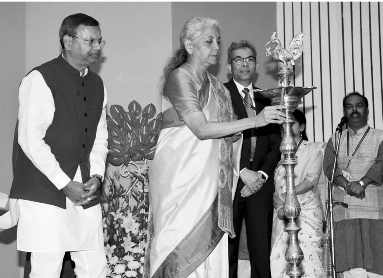
Union Minister for Finance and Corporate Affairs Nirmala Sitharaman lighting the lamp at the 65th Foundation Day of the Directorate of Revenue Intelligence (DRI), in New Delhi