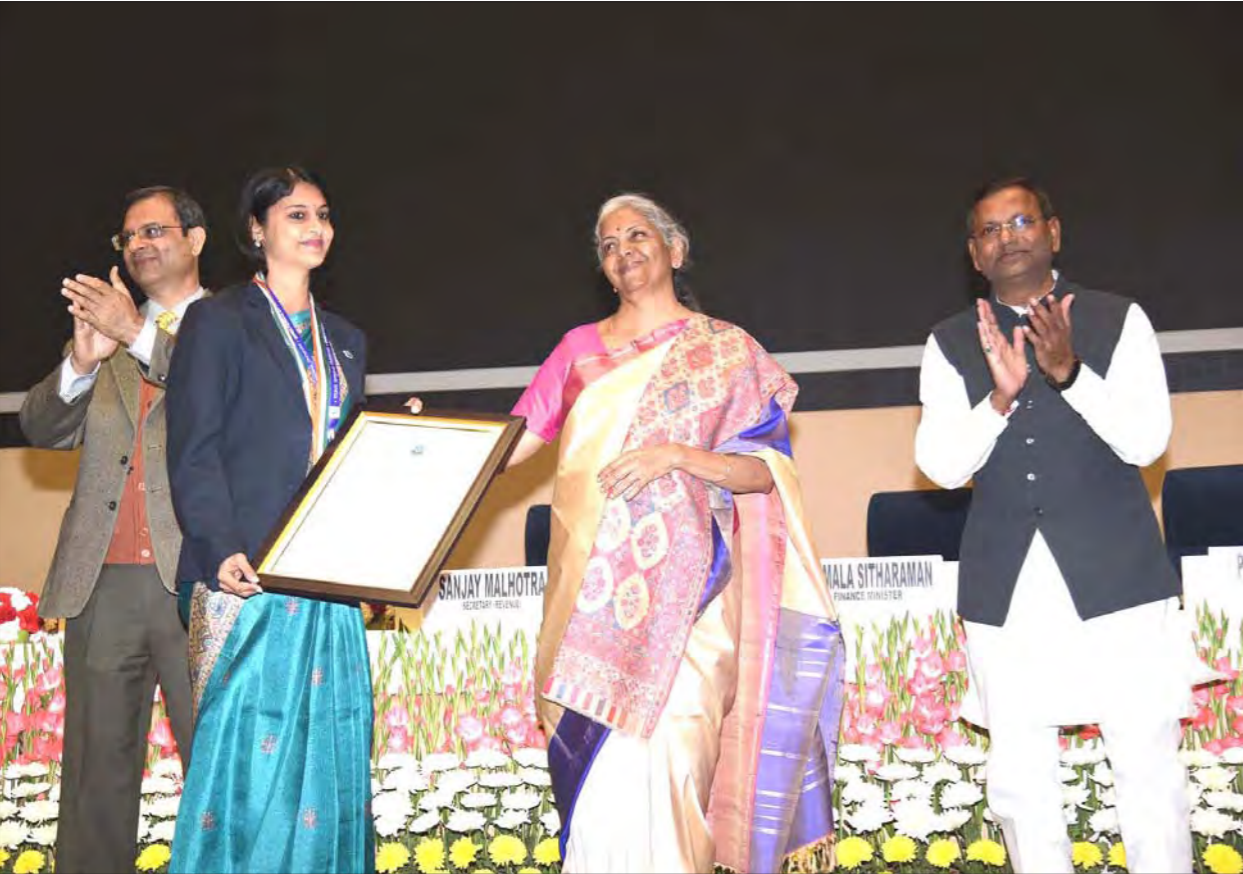
Union Minister for Finance and Corporate Affairs Nirmala Sitharaman at the 65th Founding Day of the Directorate of Revenue Intelligence (DRI), in New Delhi