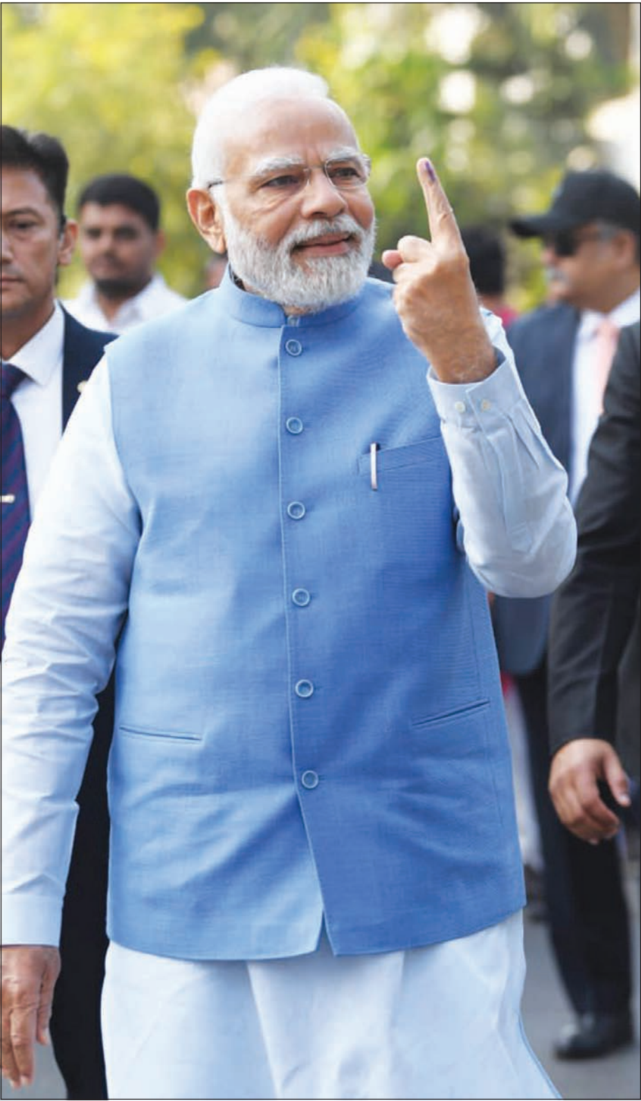
Prime Minister Narendra Modi showing ink-marked finger after casting vote during the second phase of Gujarat Assembly election, in Ahmedabad on Monday

elections said the BJP was likely to get 117-140 seats, Congress-NCP 34-51, AAP 6-13 and others 1-2. Republic TV P-MARQ predicted 128-148 seats for the BJP, 30-42 for the Congress-NCP, AAP 2-10 and others 0-3. TV9 Gujarati forecast that the BJP would get 125-130 seats, Congress-NCP 40-50, AAP 3-5 and others 3-7. For Himachal Pradesh, Aaj Tak-Axis My India predicted a close contest between the Congress and the BJP. It said the BJP would get 24-34 seats and the Congress 30-40 seats. News 24-Today's Chanakya also pointed to a cliffhanger in Himachal Pradesh, predicting 33 seats for both the BJP and the Congress with a margin of plus-minus seven seats for both. While ABP News C-Voter said the BJP was likely to get 33-41 seats and Congress 24-32, India TV predicted that the BJP would bag 35-40 seats, Congress 26-31 and AAP zero. News X-Jan Ki Baat survey said the BJP was likely to get 32-40 seats in the hill state, Congress 27-34 and AAP zero. While Republic TV P-MARQ predicted that the BJP would get 34-39, Congress 28-33 and AAP 0-1, the Times Now-ETG said the average seats BJP was likely to get was 38 and the Congress 28. For the Municipal Corporation of Delhi polls, most exit polls predicted a huge win for the AAP over the BJP with the Congress a distant third. (PTI)