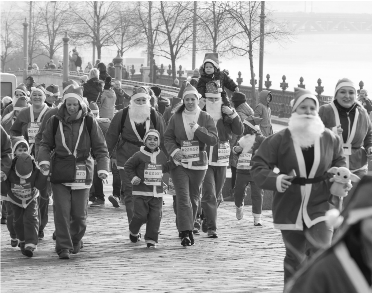
People in Santa Claus costumes participate in the Santa Run in downtown Budapest, Hungary