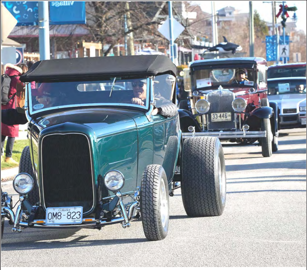
Classic cars are seen cruising on a street during the annual Christmas Classic Car Cruise event in Richmond, British Columbia, Canada