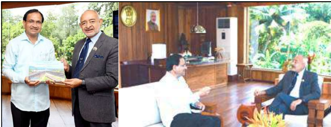
Shri Bhagwanth Khuba, Hon'ble Union Minister of State for Chemicals & Fertilizers and New and Renewable Energy and Member of Lok Sabha from Bidar Lok Sabha constituency in Karnataka on visit to A&N Islands from 24 th to 27 th Oct., 2022 met Admiral D K Joshi, PVSM, AVSM, YSM, NM, VSM (Retd.), Hon'ble Lt Governor, A&N Islands and Vice-Chairman, Islands Development Agency today at Raj Niwas. Discussed various Infra/Developmental Mega projects being implemented by Andaman & Nicobar Administration under the aegis of Islands Development Agency.