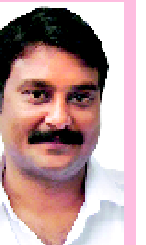
Kuldeep Rai Sharma Member of Parliament

On the occasion of Ganesh Chaturthi I convey my warm greetings to the people of Andaman and Nicobar Islands. This important festival is celebrated across the country with great devotion and gaiety and with the participation of youths in large number. Lord Ganesh is believed to be the Lord of success, who blesses his followers with their desired achievements by removing the obstacles of their paths. Hence, "Vignaharta" is one of the popular names of Lord Ganesh, which means "demolisher of obstacles". Ganesh Chaturthi is also a festival that evokes feelings of love and togetherness between people creating a pleasing atmosphere. I pray to Lord Vigneswara to shower His choicest blessings on all of us to lead a life of peace and harmony this year. May Lord Ganesh lead all the people of Andaman and Nicobar on the path of progress, happiness, peace and prosperity.