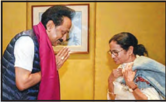
Chief Minister Mamata Banerjee (R) with her TN counterpart M K Stalin — File photo