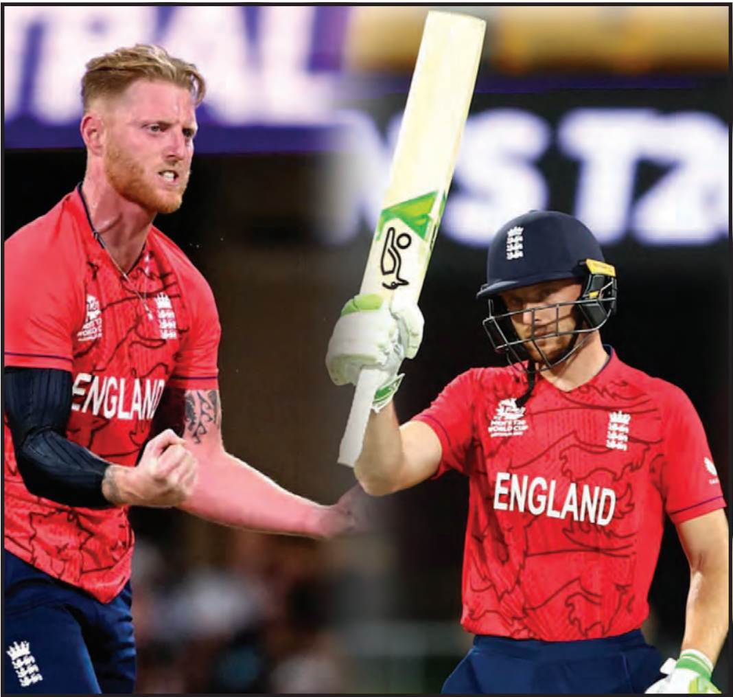
Ben Stokes is pumped up after getting Kane Williamson. Jos Buttler scored a steady half-century