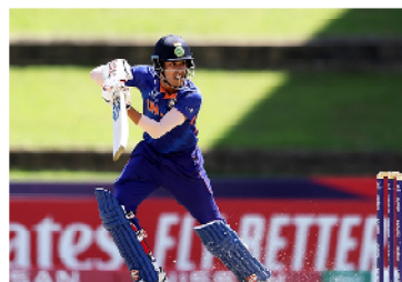
won the tournament four times.

Listen to the latest songs, only on JioSaavn.com India are the most successful team in the U19 World Cup, having