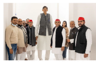
counting of votes will be held on March 10.

The Uttar Pradesh Assembly polls will take place in seven phases between February 10 and March 7. The