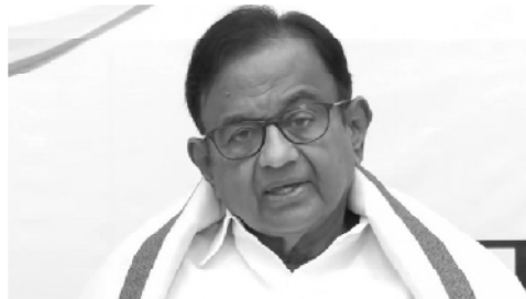
hy mn. It hurts a lot of people."

Answering a query on Trinamool Congress (TMC) national general secretary Abhishek Banerjee's remark "every vote to Congress is a vote to BJP", Mr Chidambaram said, "I hold a very humble position in the Congress party. I am not equal to the General Secretary of the All India Trinamool Congress. So I can't engage in a verbal exchange with the distinguished MP from Bengal. All I can say is that Congress has the strength, membership, deep root in Goan society and past record and history of service to the Goan people. When Goan people vote for Congress, they know they will get a Congress