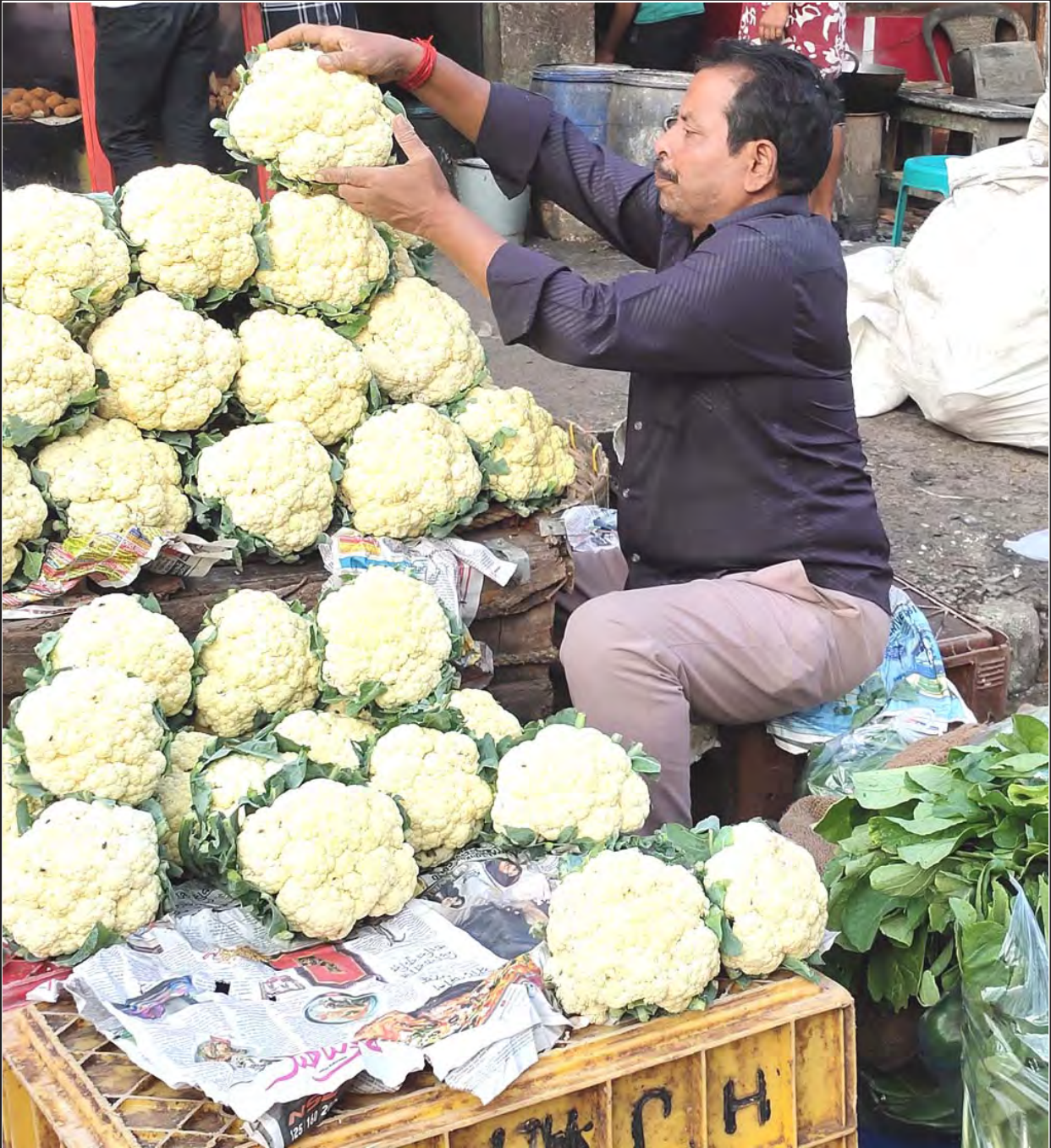
A vegetable vendor sets up his wares for sale at Bowbazar market on Thursday

The draft is, however, expected to meet continued opposition over much of the retention of control over citizens data and access to it for the government and its agencies. The government was forced to withdraw the earlier bill due to political as well as judicial pressure on account of the scope for abusing personal data both by the government as well as the companies collecting such data. (IPA)