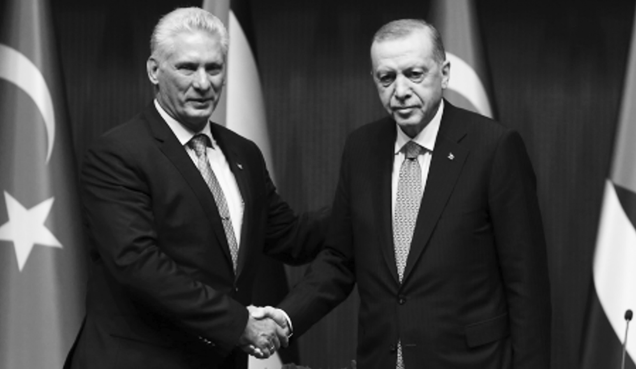
Turkish President Recep Tayyip Erdogan (R) shakes hands with Cuban President Miguel Diaz-Canel at a joint press conference in Ankara