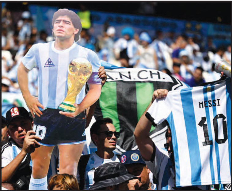
Diego Maradona's presence is unmissable at the FIFA World Cup

it and feel the importance," he said. More than 30,000 Argentina fans are in Qatar for this year's tournament and while many worship current number 10 Lionel Messi, Maradona's name still carries an almost mystical force. Argentina fans hold a picture of legend Diego Maradona prior the World Cup match between Argentina and Saudi Arabia at the Lusail Stadium. Many have been on a pilgrimage to a giant Maradona mural near the Khalifa stadium in Doha. At Argentina's first game — a shock 2-1 defeat by Saudi Arabia — there were Maradona masks, banners and shirts on display in the stadium. And aficionados say there will be many public tributes to Maradona on Friday. One group plans a march to the Maradona FanFest at Doha's international airport. The main attraction there is a hologram of the player plus a "tribute jet" bearing images of