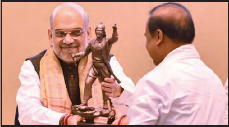
Union Home Minister Amit Shah being felicitated by Assam CM Himanta Biswa Sarma during 400th birth anniversary celebrations of Ahom Commander Lachit Barphukan, at Vigyan Bhawan in New Delhi on Thursday

question of purported video of jailed AAP minister Satyendar Jain in which he is seen receiving special treatment at Tihar Prisons, Shah suggested that it should be posed to the Arvind Kejriwal-led Aam Aadmi Party to respond whether or not the video was genuine. "If the video is genuine, the accountability lies on his party and you are asking questions from me. I had also gone to jail and resigned as minister. Such shamelessness to cling to the post of a minister even after lodged in jail is unprecedented", he said. When asked about provisions allowing the Centre to remove a minister in such a scenario, he said even the Constitution makers had perhaps not seen such things coming, and hence, there was no such provision. To a question on the need of having anti-conversion laws, Shah said