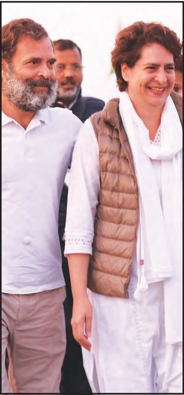
Congress leader Rahul Gandhi with his sister and party's general secretary Priyanka Gandhi Vadra during Bharat Jodo Yatra in Khandwa, Madhya Pradesh on Thursday

Constructed in the year 2009, this community has been used by the villagers for marriage and family functions. PRIs members also conduct village level meetings in this community hall on a regular basis. However, after its inauguration some 12 years ago, no repair work has been carried out. As a result of lack of repair work, the community hall at GP Shivapuram presents a picture of neglect. Speaking to EOI, a PRI of GP Shivapuram said that after years of delay, finally the estimates for carrying out the renovation work of the community hall have been sent to the Engineering Wing and immediately after approval, the tendering process for renovation of the community hall will be started. Villagers have complained that for organizing social events like marriages, birthday functions and village meetings, they have to depend on the neighbouring Panchayats. "If we are lucky enough, we get the booking of the community hall of our neighbouring Panchayats. However, first preference is given to the demands of their own villages", said a villager of Shivapuram.