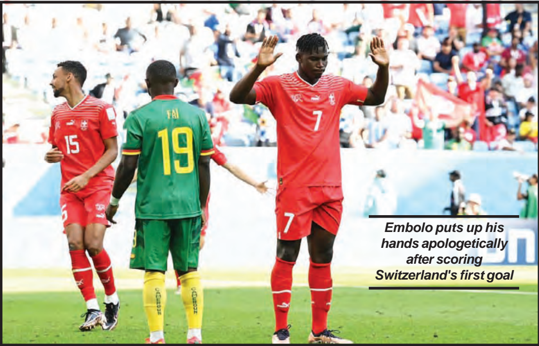
Embolo puts up his hands apologetically after scoring Switzerland's first goal

DOHA, NOV 24 /--/ witzerland edged past Cameroon 1-0 courtesy of a goal against the run of play by Cameroon-born Breel Embolo on Thursday for an opening win in World Cup Group G. Embolo, born in Yaounde but raised in Basel, struck three minutes after the restart from a Xherdan Shaqiri cutback to put them top of Group G. The 25-year-old refused to celebrate the goal as the small group of Swiss fans cheered wildly at Al Janoub Stadium. Serbia plays Brazil in the other group match later on Thursday. The Swiss goal came after Cameroon, without a win in the World Cup for 20 years, had dominated the first half, missing several good chances to take the lead. The Indomitable Lions, who eliminated Algeria in a playoff to qualify for the tournament, had outplayed the Swiss in the first 45 minutes with quick combinations, speed and power as their opponent remained toothless up front. They carved out their first chance after