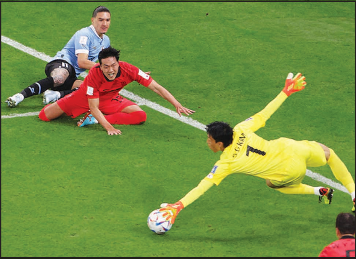
South Korea goalkeeper Kim Seung-gyu catches the ball during a World Cup game with Uruguay in Qatar

DOHA, NOV 24 /--/ Uruguay hit the post twice but couldn't break down South Korea's defence as both teams played out a pulsating 0-0 draw in a Group H clash at the Education City Stadium. Diego Godin rattled the post with his header in the first-half, before Federico Valverde's effort crashed the crossbar. South Korea, too, had plenty of openings but couldn't find the back of the net. South Korea started the game with plenty of pressing in the first 45, before Uruguay started to dictate tempo after the break. Hwang Ui-jo had the biggest opportunity for Korea but he had blazed his effort just over the bar. Darwin Nunez had a couple of cracks in front of the goal but dragged his effort wide. In the second-half, South Korea heavily relied on the counters but failed to create something major.