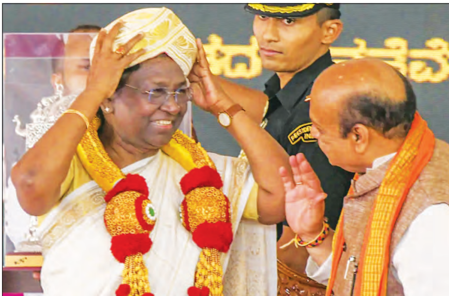
President Droupadi Murmu wearing a Mysore 'peta' during the inauguration of the Mysuru Dasara Festival, at Chamundi Hills in Mysuru. Karnataka Chief Minister Basavaraj Bommai is also seen

DHARWAD, SEPT 26 /--/ The world is now moving towards the fourth industrial revolution, and India has to make relentless efforts to secure a leading position on the world stage in this connection, President Droupadi Murmu said on Monday. Murmu was speaking at the inauguration of the new campus of the Indian Institute of Information Technology (IIIT)-Dharwad here. "The country and the world is changing rapidly. Through the Digital India Mission, our country is experiencing digital revolution, but to reap benefits of this revolution, we will have to further encourage our research and innovation," Murmu said. Highlighting that today's world belongs to 'metaverse', she said, on the strength of artificial intelligence (AI) and augmented reality, useful changes can be made. "The world is now moving towards the fourth industrial revolution which has the potential to raise income levels and improve the quality of life for the world community. Therefore, we have to make relentless