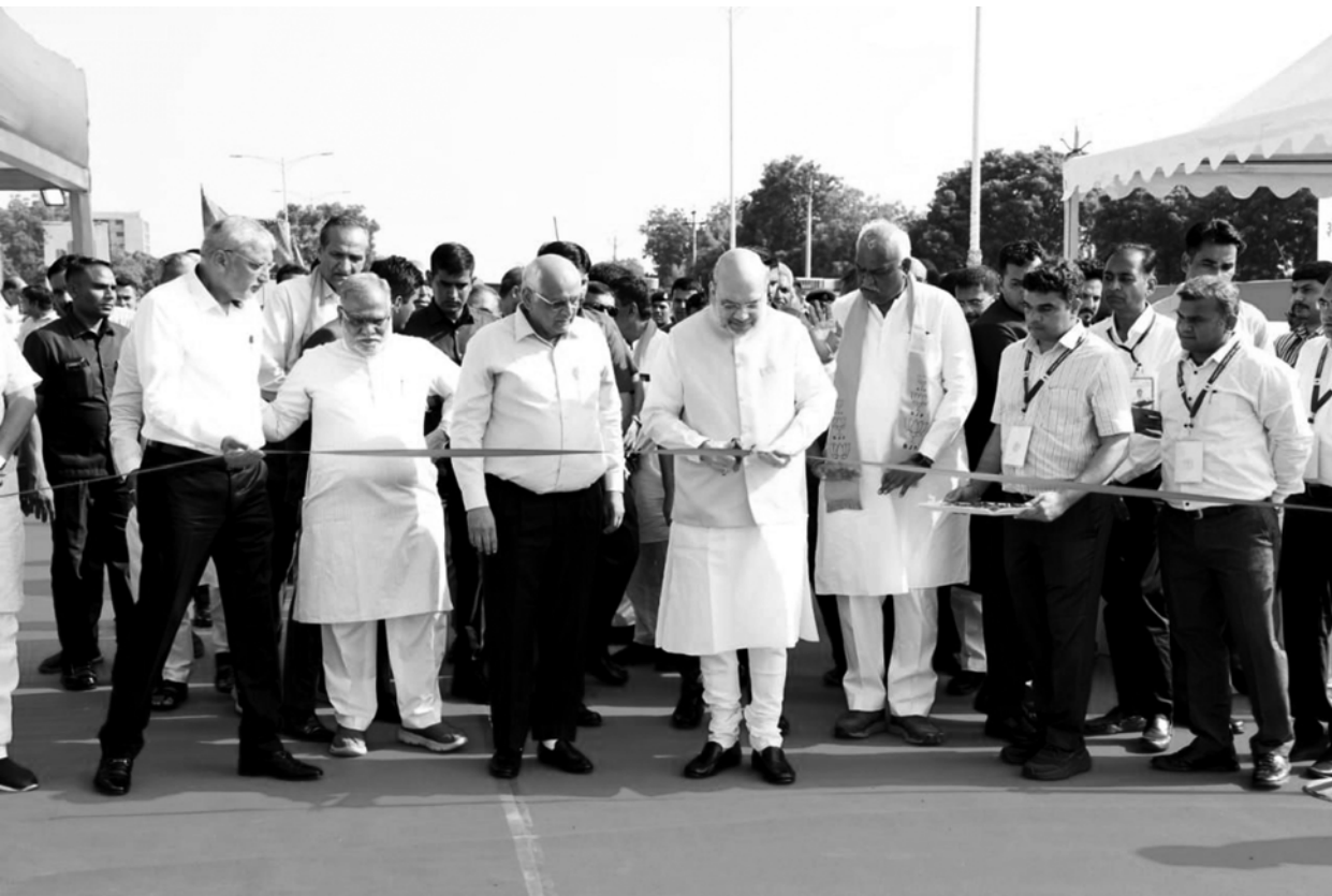
Union Home Minister Amit Shah inaugurating over bridge built at Bhadaj Circle in Ahmedabad on Monday

NEW DELHI, SEPT 26 --/ The Delhi government on Monday started vaccinating healthy cattle to prevent the spread of lumpy skin disease, which has so far infected 571 animals in the national capital, officials said. A total of 275 animals have recovered from the infection in Delhi so far, and the number of active cases stands at 296. "We have procured 25,000 doses of goat pox vaccine from Indian Immunologicals Limited and have started vaccinating healthy cattle in Delhi today," an official of the animal husbandry department said. These doses will be administered free of cost. It will take around a week to complete the vaccination drive, he said. The government will adopt the ring vaccination strategy in which healthy cattle in a five-km radius of the affected areas will be inoculated with the Uttarakashi strain of the virus, the official said. Most cases of lumpy skin disease have been detected in the southwest Delhi district - in the Goyla dairy area, Rewla Khanpur area, Ghumanhera and Najafgarh. (PTI)