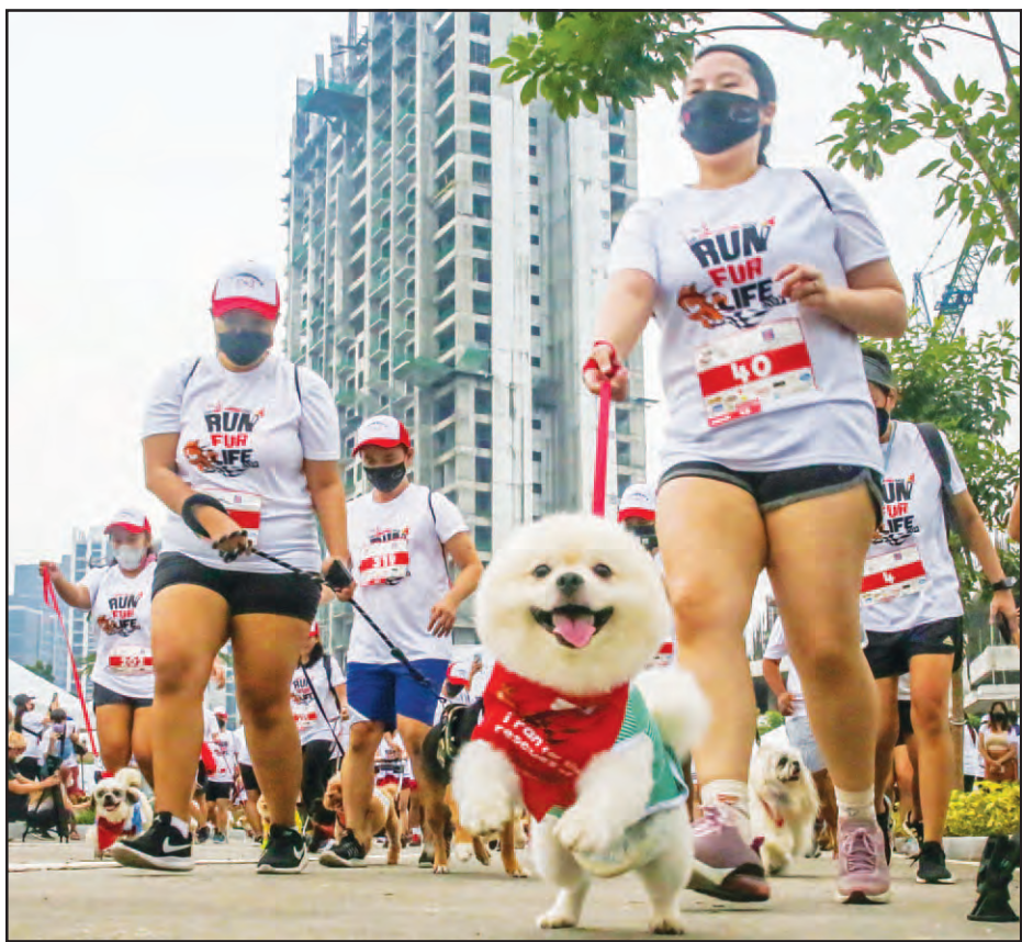
Dogs run with their owners during the "Run Fur Life" marathon in Pasig City, the Philippines yesterday. The "Run Fur Life" is a fundraising event for the benefit of maltreated, abandoned, and homeless dogs and also aims to promote animal welfare and responsible pet ownership