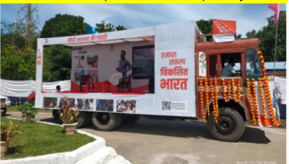
IEC Van containing information on various schemes

The Vans will travel to rural and urban areas, disseminating information through audio-visuals, brochures, pamphlets and other mediums in regional languages. One of the major components of this yatra is that, it will not only disseminate information but also collect feedback about the schemes. During the Yatra, people will be able to share their experiences 'Kahaani Meri Zubaani' and participate in on spot Quiz Competition. Prime Minister's Mann Ki Baat will be live telecast through these vans. In addition, virtual question and answer session will be held with the Prime Minister. On-the-spot services such as Health Camps, Aadhaar enrolment, MY BHARAT volunteer enrolment would also be facilitated during the Yatra. Krishi activities like drone demonstrations and interaction with progressive farmers on Soil Health Cards and natural farming will also be the key objectives of the Yatra.