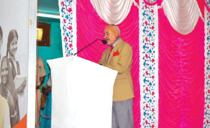
Hon'ble Lt. Governor addressing the gathering at Community Hall, Campbell Bay