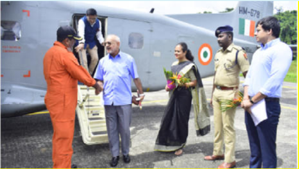
Hon'ble Lt. Governor being accorded a warm welcome on his arrival at Campbell Bay