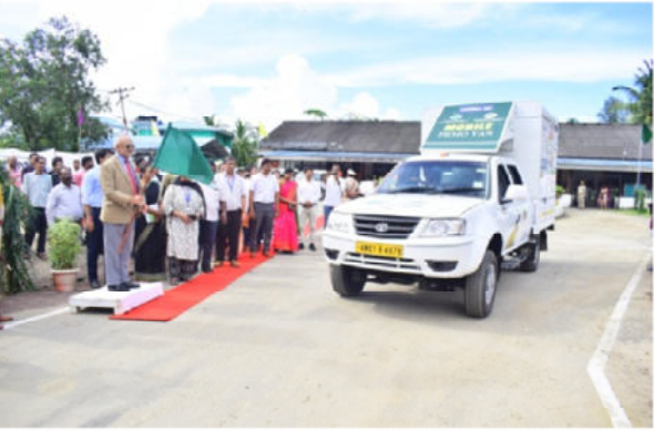
Hon'ble Lt. Governor flagging off mobile Demo Van-cum-ATM of State Cooperative Bank at Campbell Bay

All the claims and objections were addressed by the examination conducting agency and the revised answer key will be uploaded on the portal https://erecruitment.andaman.gov.in/crap on 16 th Nov, 2023, a press release from Designated Officer (FS), South Andaman District said.