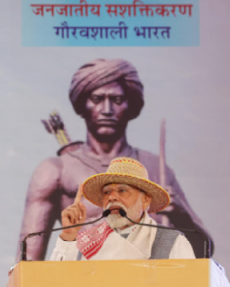
Hon'ble Prime Minister addressing the programme marking the celebrations of Janjatiya Gaurav Diwas at Khunti, in Jharkhand

mentioned that many heroes like Tilka Manjhi, Sidhu Kanhu, Chand Bhairav, Phulo Jhano, Nilambar, Pitambar, Jatra Tana Bhagat and Albert Ekka have made this land proud. The Prime Minister said Adivasi warriors took part in the freedom struggle in every nook and