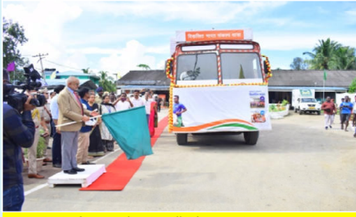
Hon'ble Lt. Governor flagging off IEC van marking the launch of 'Viksit Bharat Sankalp Yatra' at Campbell Bay