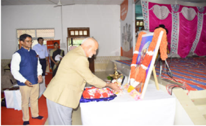
Hon'ble Lt. Governor paying floral tributes to the portrait of Bhagwan Birsa Munda at Community Hall, Campbell Bay

Staff Correspondent Port Blair, Nov. 15 The Hon'ble Prime Minister, Shri Narendra Modi today launched the 'Viksit Bharat Sankalp Yatra' and Pradhan Mantri Particularly Vulnerable Tribal Groups Development Mission from Khunti District of Jharkhand marking the celebrations of Janjatiya Gaurav Diwas, 2023. The programme which was live streamed across the nation was witnessed by the Lt. Governor, A&N Islands and others present at a function organised by the A&N Administration at Community Hall, Campbell Bay - the Southernmost part of India. As part of the Viksit Bharat Sankalp Yatra, the Hon'ble Lt. Governor, A&N Islands and Vice Chairman, Islands Development Agency, Admiral D K Joshi, PVSM, AVSM, YSM, NM, VSM (Retd.) today flagged off Information, Education, and Communication Vans from Campbell Bay. The Lt. Governor also paid floral tributes to the portrait of Bhagwan Birsa Munda on the occasion.