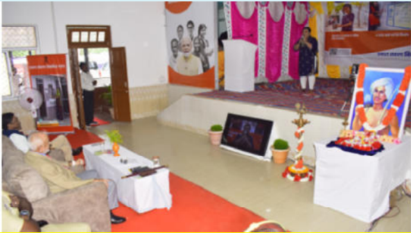
A beneficiary sharing experience of the scheme availed

Bharat Sankalp Yatra' will start in North & Middle Andaman and in South Andaman Districts from the third week of November, 2023.