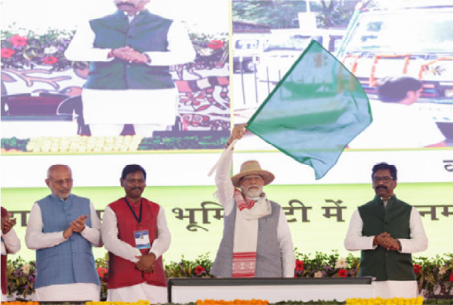
Hon'ble Prime Minister flags off IEC van at the launch of 'Viksit Bharat Sankalp Yatra' at Khunti, in Jharkhand on November 15, 2023

New Delhi, Nov.15 (PIB) The Hon'ble Prime Minister, Shri Narendra Modi addressed the program marking the celebrations of Janjatiya Gaurav Diwas, 2023 in Khunti, Jharkhand today. During the programme, the Prime Minister launched 'Viksit Bharat Sankalp Yatra' and Pradhan Mantri Particularly Vulnerable Tribal Groups Development Mission. He also released the 15 th installment of PM-KISAN. He also took a walkthrough of the exhibition showcased on the occasion. A video message from the Hon'ble President of India, Smt Droupadi Murmu was played on the occasion. The Prime Minister also led the Viksit Bharat Sankalp pledge on the occasion. The Prime Minister began his address by recalling his visit to Ulihatu Village, the birthplace of Bhagwan Birsa Munda as well as the Birsa Munda Memorial Park- cum- Freedom Fighter Museum in Ranchi earlier today. He also mentioned inaugurating the Freedom Fighter Museum two years ago on this day. Shri Modi congratulated and conveyed his best wishes to every citizen on the occasion of Janjatiya Gaurav Diwas. He also conveyed his greetings on the occasion of the Foundation Day of Jharkhand and highlighted the contributions