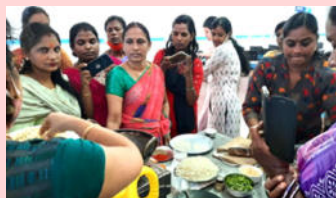
Handholding and skill training support to SHG

Course, 60 for Assistant Beauty Therapist course and 30 in Assistant Electrician Course.