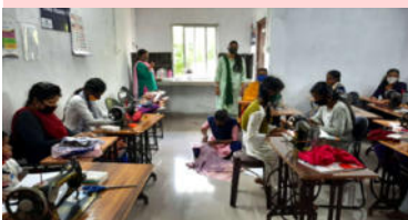
Skill Training for Unemployed under ESTP