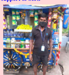
Support to Urban Street Vendors of Port Blair City

Under Support to Urban Street Vendor, the PBMC has issued Certificate of Vending (CoV) to 670 urban street vendors giving them their right to vending in compliance to instructions given under Street Vendors Protection & Livelihood Act 2014. As of now, micro credit loan for 462 Street Vendors have been facilitated with Rs. 10,000/- each as first tranche loan and 13 vendors with Rs. 20,000/- as second tranche loan under PM SVANidhi.