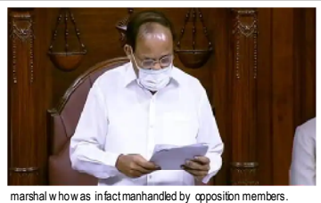
marshal who was in fact manhandled by opposition members.

The government, however, rejected such claims and, in turn, alleged that it was a woman