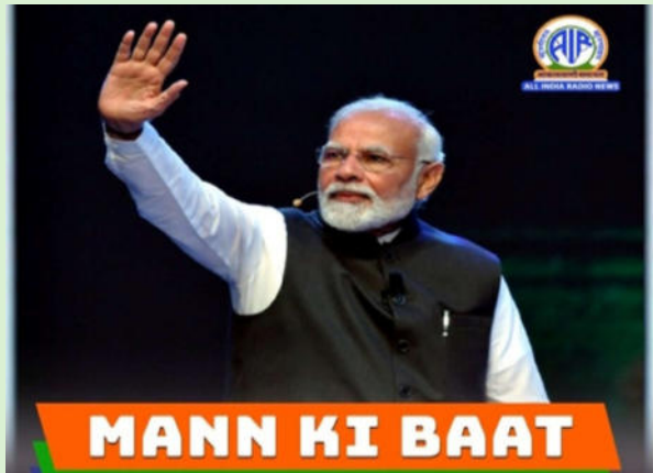
MANN KI BAAT

The Prime Minister took pride in the fact that the number of startups in the space sector amounts to more than a hundred. Until a few years ago in the country, no