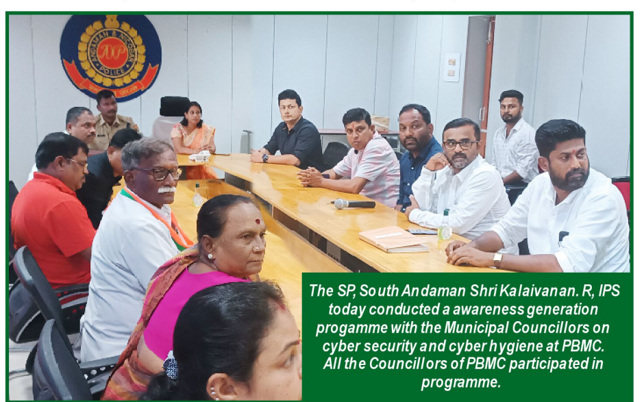
The SP, South Andaman Shri Kalaivanan. R, IPS today conducted an awareness generation programme with the Municipal Councillors on cyber security and cyber hygiene at PBMC. All the Councillors of PBMC participated in programme.

Port Blair, Oct 6: The Directorate of Agriculture is implementing a Central Sector Scheme RKVY-RAFTAAR under which, one project namely 'Creation of Marketing Infrastructure' is undertaken for postharvest marketing support to farmers. The said project is continued during 2022-23. Under the said project, back ended subsidy is provided for purchase of Truck of 1.5-2.0 MT capacity for transportation of agricultural produce by the farmers/ Farm Women/ST farmers. Registered FPG/SHG/FPO /NGO/CPC or CPS can contact the Zonal Officer of their area and apply in the prescribed format along with requisite documents. The subsidy under the scheme is 50% limited to Rs 2.50 lakhs per truck. To avail the benefit of the scheme, eligible farmers/ Farm Women/ST farmers, Registered FPG/SHG/FPO /NGO/CPC or CPS can contact the Zonal Officer of their area and apply in the prescribed format along with requisite documents.