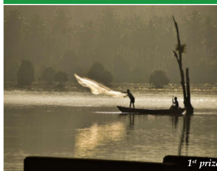
1 st prize