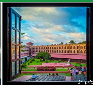
2 nd prize