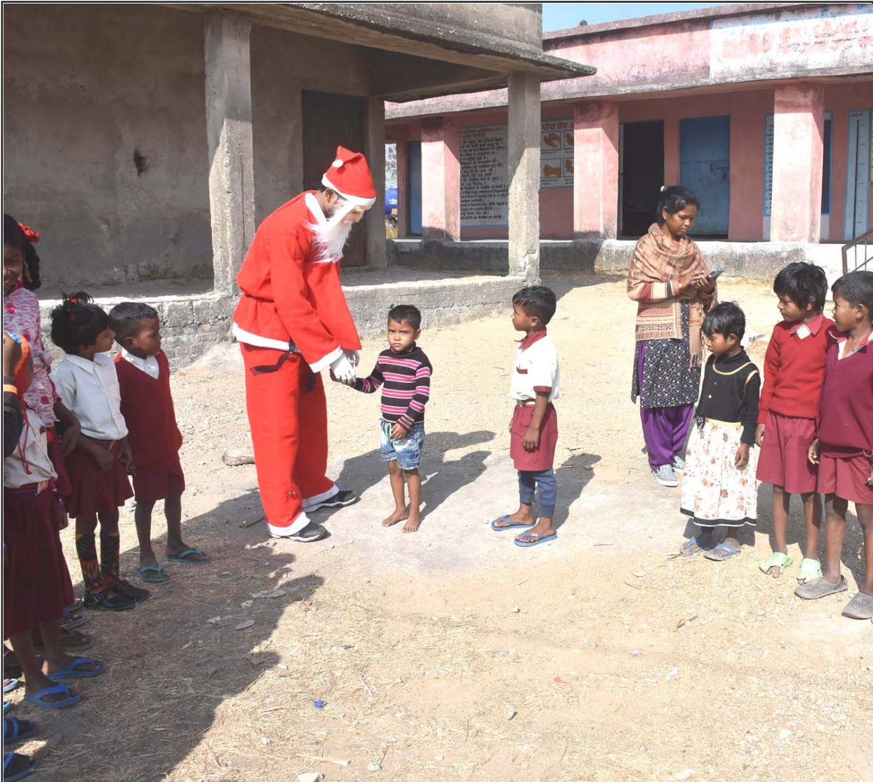
A man dressed as Santa Claus poses for a photograph with children at a school ahead of Christmas and New Year 2023 celebrations, in Ranchi

Farmers' organisations demanded lifting of ban on exports of foodgrains and restriction on imports that cost below the Minimum Support Price (MSP). It is worth mentioning here that earlier demand for legal guarantee for MSP is yet unmet and government is have not been willing