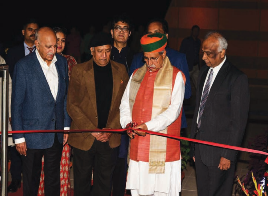
Minister of State for Parliamentary Affairs and Culture, Arjun Ram Meghwal inaugurates the first Light and Sound show of Pradhanmantri Sangrahalaya on journey of India's space programme, in New Delhi

All the aspiring entrepreneurs willing to venture into the food processing sector or existing enterprises and other stakeholders have been invited to participate in the Andaman Food Processing Conclave scheduled on Dec.8 at 10 am at Megapode Nest.