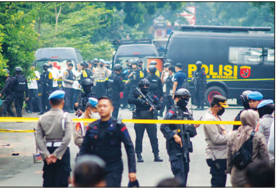
Police officers stand guard near the police station hit by a suicide bombing in Bandung, Indonesia

BANDUNG, DEC 7 /--/ A Muslim militant and convicted bomb-maker who was released from prison last year blew himself up on Wednesday at a police station on Indonesia's main island of Java, killing an officer and wounding 11 people, officials said.