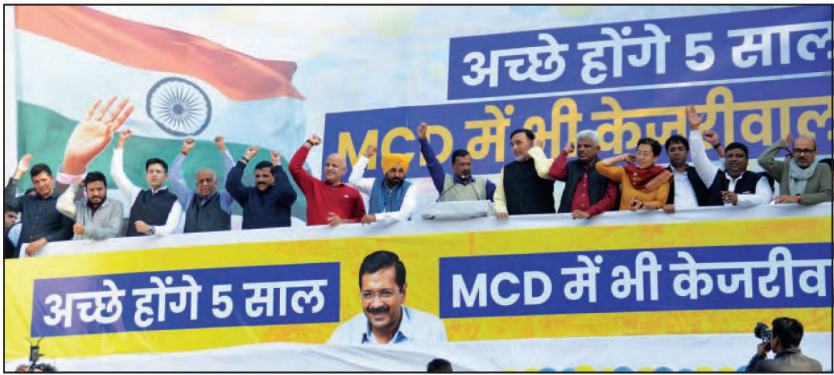
Delhi Chief Minister and Aam Aadmi Party convenor Arvind Kejriwal with Deputy Chief Minister Manish Sisodia and Punjab Chief Minister Bhagwant Mann flash victory sign after party's victory in MCD elections, in New Delhi on Wednesday

AAP Rajya Sabha MP Sanjay Singh said the barely 10-year-old party's "defeat" of the country's largest party (BJP) in their stronghold "have once again proved the AAP is a hardcore honest party." The counting of votes began at 8 am and initial