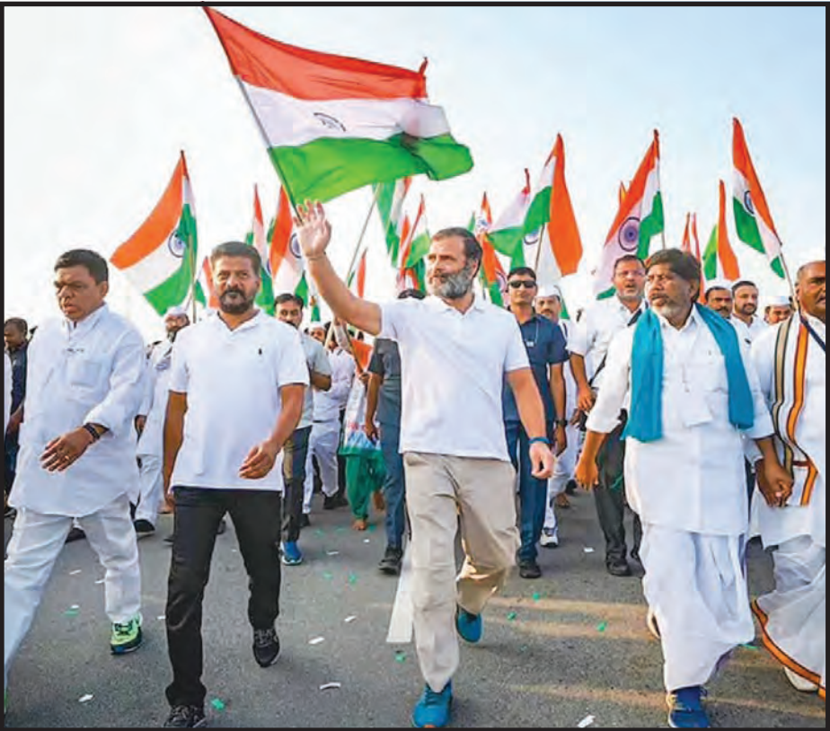
Congress leader Rahul Gandhi during 'Bharat Jodo Yatra' in Kamareddy

and Adivasis that were allegedly grabbed would be returned to them. Rahul alleged that education has become expensive and one has to spend lakhs of rupees to become an engineer or doctor. The former Congress president charged BJP and TRS with working in tandem and whatever Bill that the former introduces in Parliament is supported by the latter. Rahul alleged that the NDA government is privatising public sector undertakings such as BHEL and Railways to benefit some friends of the Prime Minister Narendra Modi. Congress sources said Rahul Gandhi undertook a 375-KM march in Telangana. President of the Congress's Telangana unit Revanth Reddy would hand over the national flag to his Maharashtra counterpart Nana Patole on the border: (PTI)