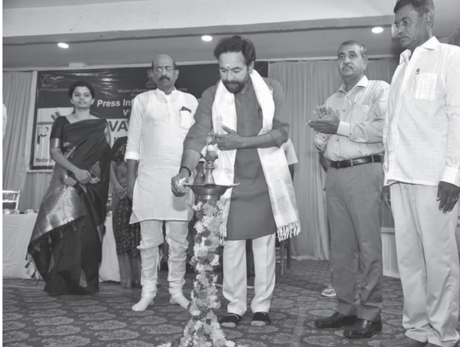
Union Minister for Culture, Tourism and Development of North Eastern Region (DoNER), G. Kishan Reddy lighting the lamp at the inaugural 'Vartalap media workshop' for journalists organised by PIB Vijayawada, in Nellore

gion and neighbouring states including Punjab, Himachal Pradesh and Haryana are expected to take part in the fair to commemorate the sacrifice of the Baba, a farmer who gave up his life in protest against the oppressive demands of the 'zamindar' (landlords) about 500 years ago. His daughter, as per the legend, also took her life by jumping on her father's funeral pyre. The devotees also take a customary dip in the Baba-da-Talab, a natural pond four km from the temple which is believed to have curative powers, officials said. (PTI)