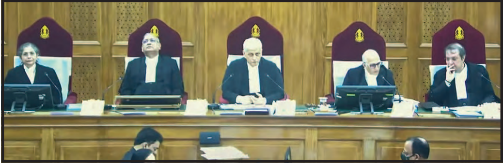
The bench of Supreme Court judges during pronouncing of verdict on 10 per cent quota in colleges and government jobs for the poor or EWS (Economically Weaker Sections), in New Delhi

by permitting the State to make special provisions, including reservation, based on economic criteria," read the first issue framed. The second legal question was whether the constitutional amendment could be said to breach the basic structure by permitting the state to make special provisions concerning admissions to private unaided institutions. "Whether the 103rd Constitution amendment can be said to breach the basic structure of the Constitution in excluding the SEBCs/OBCs, SCs/STs from the scope of EWS reservation," the third issue, to be adjudicated upon by the bench, read. The doctrine of basic structure was propounded