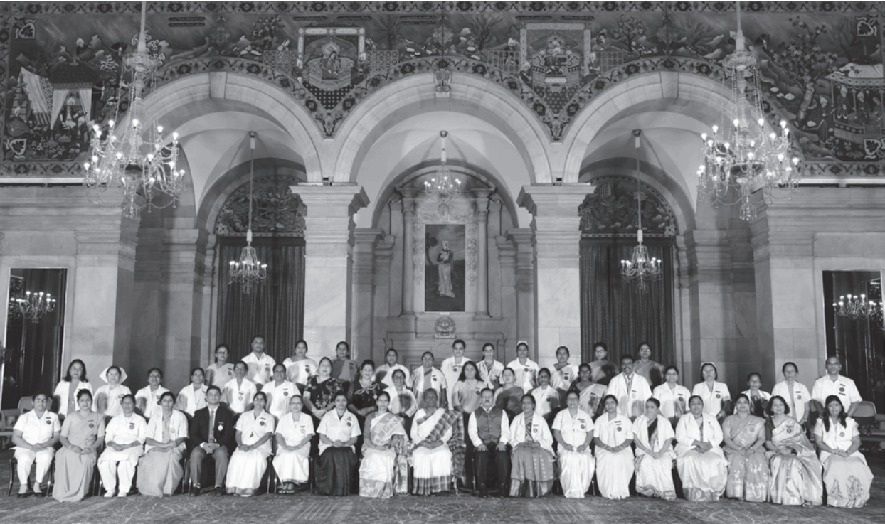
President, Smt. Droupadi Murmu in a group photo with the awardees of National Florence Nightingale Awards, 2020 and 2021, in New Delhi

cept the 740 km-long Line of Control) and the 4,096-km-long border with Bangladesh. The CRPF is deployed for internal security duties, maintenance of law and order and anti-militants operations in Jammu and Kashmir and the Northeast. The CISF guards vital installations like nuclear plants, key industries, metro networks and other important government buildings. The ITBP guards the 3,488-km-long Sino-Indian border. The SSB guards India's borders with Nepal (1,751 km) and Bhutan (699 km). The Assam Rifles guards the 1,643-km-long Indo-Myanmar border and carry out anti-militancy operations in the Northeast.