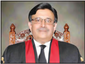
Umar Ata Bandial

addressed a press conference on Saturday and urged the Chief Justice to make a full court commission, including senior and junior judges, and also said he would send an official letter regarding the matter. Sharif had also said that if the apex court did not accept his request then such allegations would come up