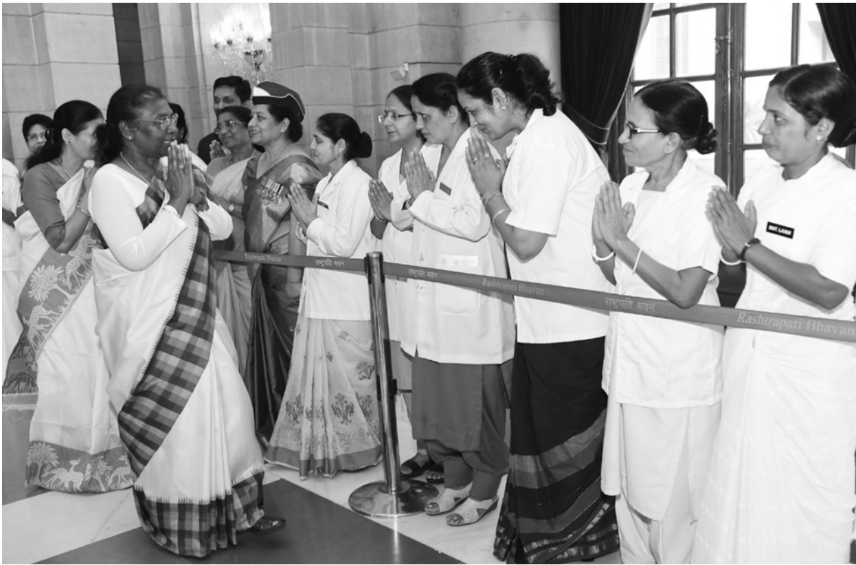
President Droupadi Murmu meeting with the recipients of the National Florence Nightingale Awards for the year 2021 to the Nursing professionals at Rashtrapati Bhavan, in New Delhi on Monday

verdicts on 40 petitions challenging the validity of the 103rd Constitution amendment promulgated by the Centre in 2019. While Justices Dinesh Maheshwari, Bela M Trivedi and J B Pardiwala upheld the law, Justice S Ravindra Bhat along with the CJI shot down the same in their minority view. The judges read four separate judgements for over 35 minutes in the courtroom. "#NewIndia under the leadership of PM @narendramodi ji is not only upholding the rights of underprivileged and vulnerable sections but also making efforts to ensure everyone gets equal opportunities," the Union minister said. (PTI)