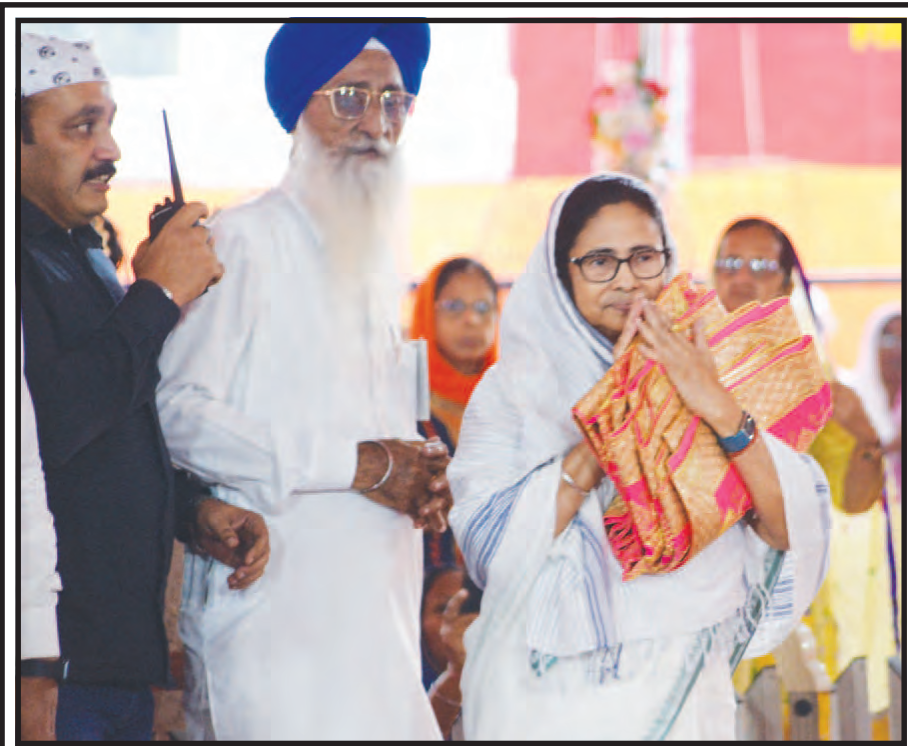
Chief Minister Mamata Banerjee with Sikh community leaders at Sahid Minar, on the eve of Guru Nanak's birth anniversary