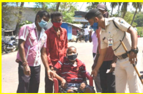
Senior citizen being helped to cast his vote