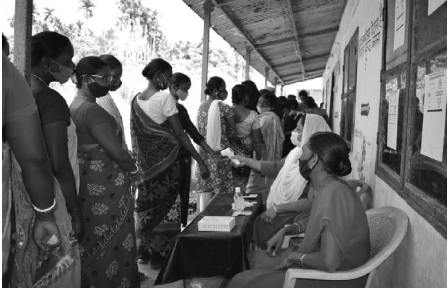
Polling Station Mathura