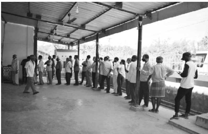
Polling Station Brindavan

COVID-19: Wash your hands regularly using soap and water or an alcohol-based hand rub.