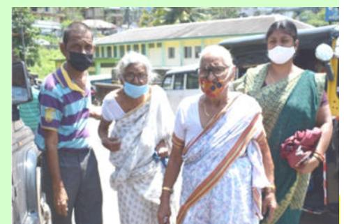
Nonagenarians coming out from Polling Booth at Garacharma School after casting their votes