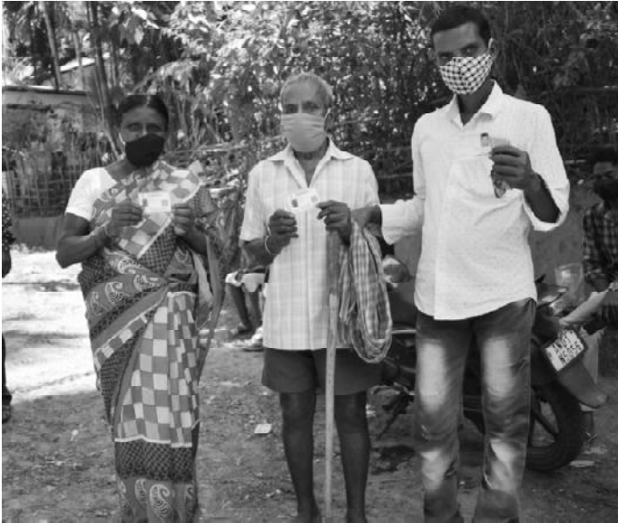
Polling Station Namunaghar