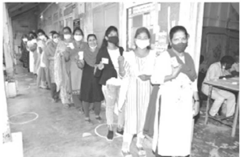
Voters queued up at Polling Station at Tamil Medium School, Haddo to cast their votes