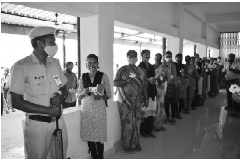
Polling Station Ferrargunj School