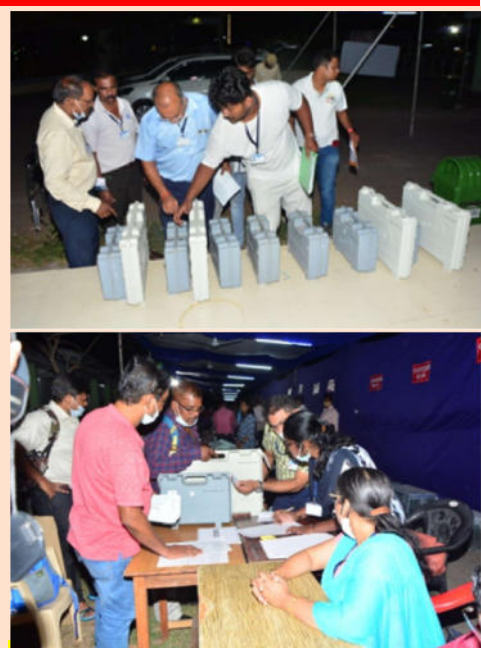
Polling Materials being brought to Collection Centre at JNRM for counting on March 8

Adequate security arrangements have also been made to ensure the safety and sanctity of the process. The Counting Agents of