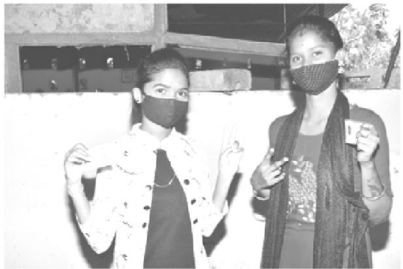
First time voters flashing their voter's ID card ready to cast their votes