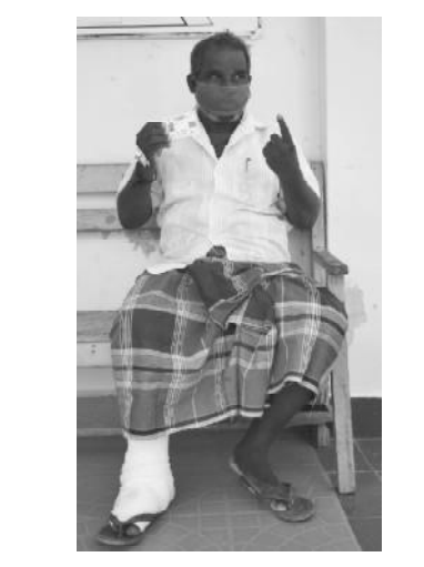
Polling Station Bhatubasti School