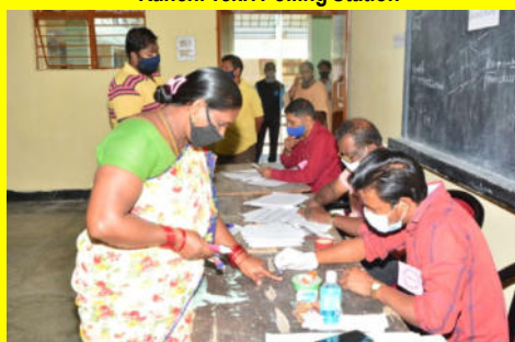
Junglhat School Polling Station