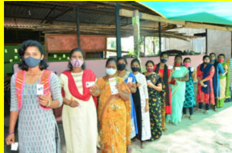
Ranchi Tekri Polling Station