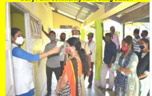
Thermal screening at Polling Station

Port Blair, Mar. 6 The Panchayat & Municipal Elections, 2022 were held peacefully for 686 constituencies of 70 Gram Panchayats and 114 Polling Booths for 24 Wards of Port Blair Municipal Council in A&N Islands today. Electronic