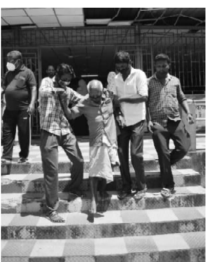
Polling Station Ograbraj