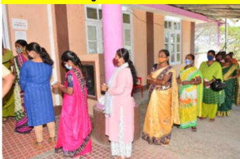
Anarkali Community Hall Polling Station