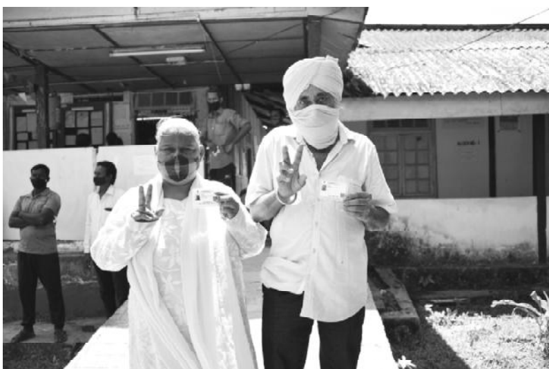
Polling Station Namunaghar