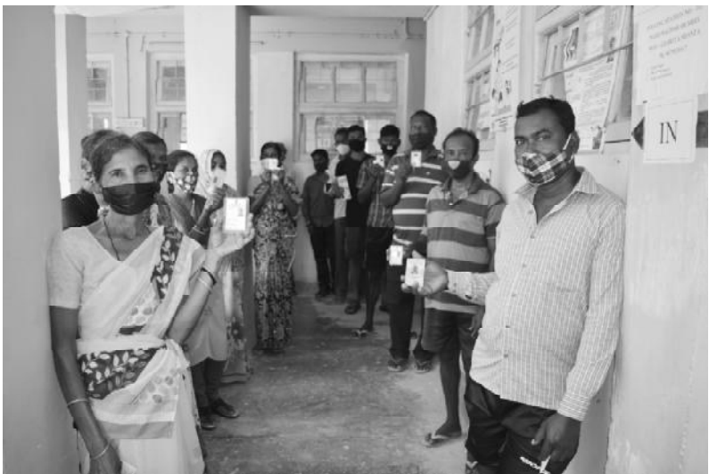
Polling Station Namunaghar