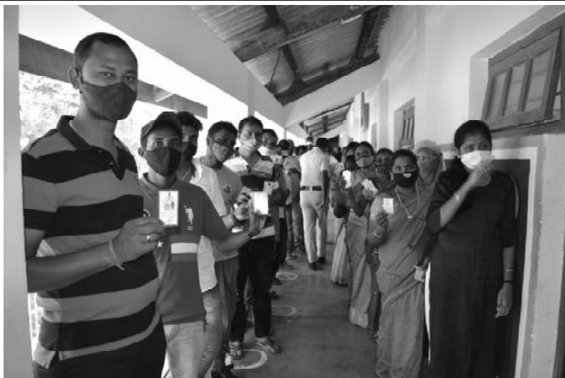
Polling Station Bhatubasti School