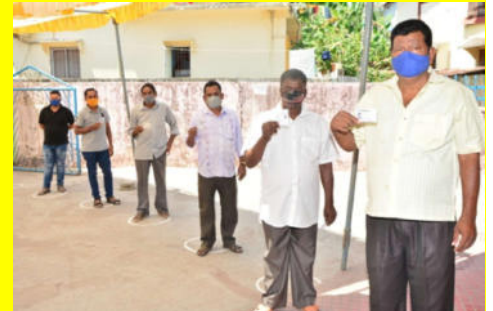
Dairy Farm Community Hall Polling Station