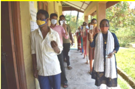
Polling Station Brindavan

Overall voter turnout for Panchayats stood at 70.29%; Municipal registers 49.23%