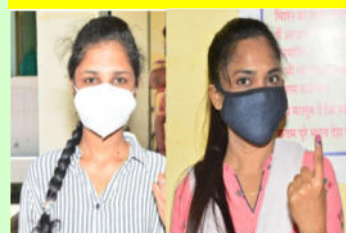
Young voters proudly displaying their finger with ink mark after casting their votes for the first time