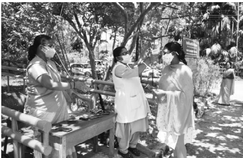
Polling Station Port Mout