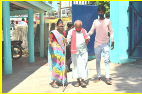
Model Sr. Sec School Polling Station