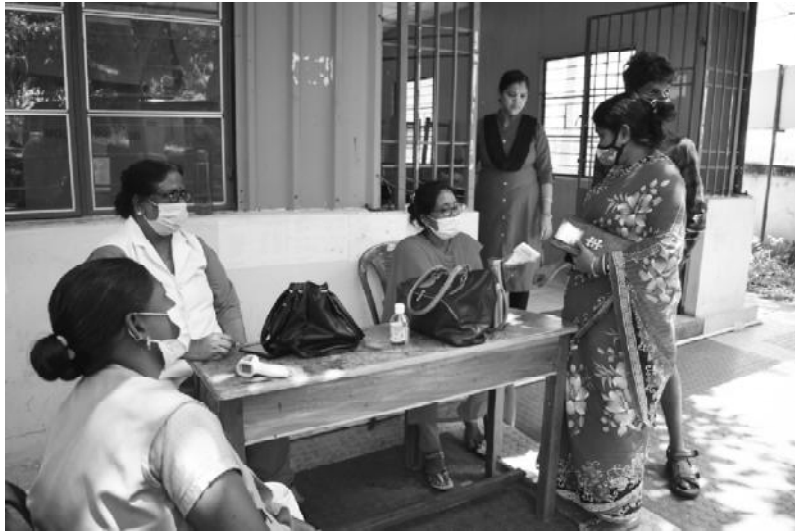
Polling Station Chouldari