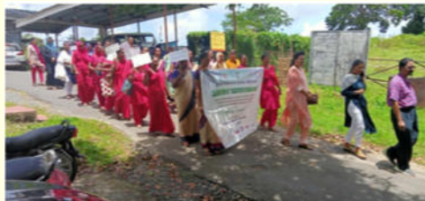
Ferrargunj Project (POSHAN Rally)

Apart from this, POSHAN Maah is being celebrated with programmes like POSHAN rally, screening camps for identification of SAM & MAM children, tribal food fairs, conduct of traditional recipe contests in tribal areas, Anaemia camps for children, adolescent girls, pregnant women & lactating mothers on menstrual hygiene, diagnosis of juvenile diabetes, promotion of buddy mothers concept, training drives on nutri-farms, promotion of millets, backyard kitchen garden in AWCs, Yoga session for pregnant women & adolescent girls