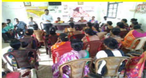
Health Awareness camp for life style disease like childhood obesity

in AWCs, promotion of wellness through yoga, workshops on techniques of water conservation and management and rain water harvesting, PMMVY registration camp etc. in Gram Panchayat, AWCs, schools and villages from Sept.1 to 30, 2022, a press release from Directorate of Social Welfare said.