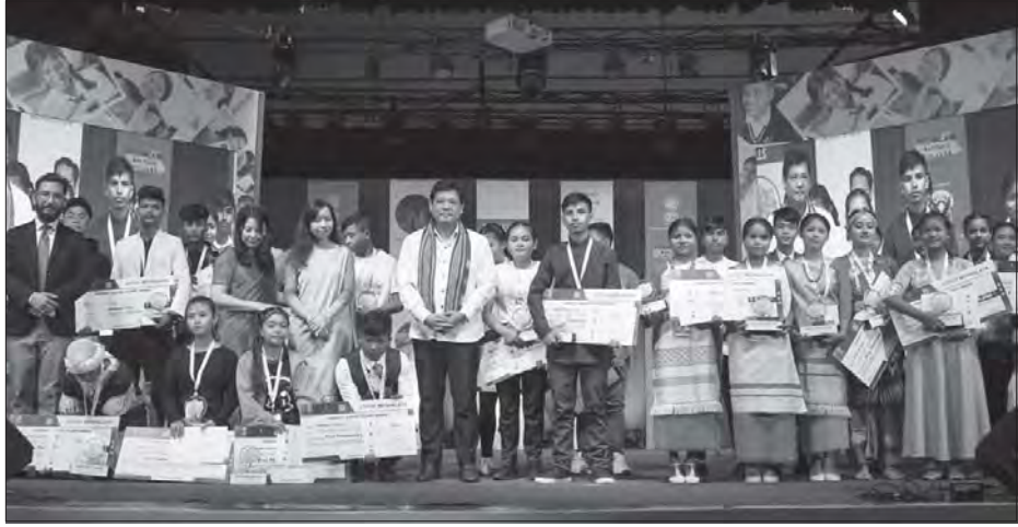
Meghalaya Chief Minister Conrad K Sangma, for their participation in the Meghalaya Youth Survey 2022 and Soft Skills Training interventions under Aspire Meghalaya, The East Khasi Hills chapter of the Meghalaya's District Talent Events 2022 at U Soso Tham Auditorium, Shillong