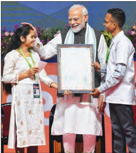
Prime Minister Narendra Modi at the launch of Mission Schools of Excellence at Adalaj in Gandhinagar on Wednesday