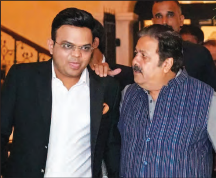
BCCI secretary Jay Shah and vice-president Rajeev Shukla

Gaya missed a late penalty amid a chaotic finale as Sevilla held the visitors to a 1-1 draw. Erik Lamela's 86th minute strike earned Jorge Sampaoli's side a creditable draw against Gennaro Gattuso's relentless Los Che, in a pulsating clash at the Ramon Sanchez Pizjuan. Sampaoli was not able to build on his first win since replacing Julen Lopetegui at the helm, but will be happy with a point as Valencia blew the chance to snatch all three in stoppage time. Edinson Cavani sent the visitors ahead with a firm header from Dimitri Foulquier's deep cross in the sixth minute. Valencia goalkeeper Giorgi Mamardashvili made two stunning saves in quick succession to deny Rafa Mir, first twisting to tip over a vicious strike, then clawing away a header. Sevilla kept pushing in the second half and Nemanja Gudelj headed against the crossbar. Both sides were guilty of heavy challenges but it created a chaotic, aggressive contest, amid which Sevilla eventually found a leveller through Lamela. (AFP)