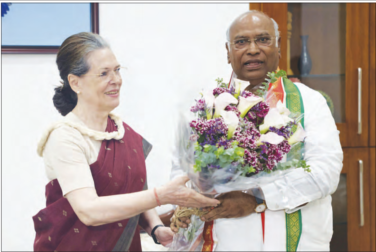
Newly elected Congress President Mallikarjun Kharge being greeted by Sonia Gandhi, in New Delhi on Wednesday