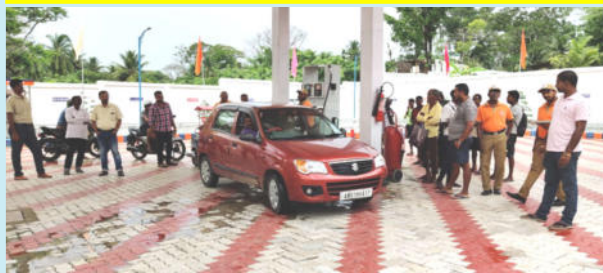
People refueling their vehicles at newly inaugurated POL Retail Outlets at Uttara