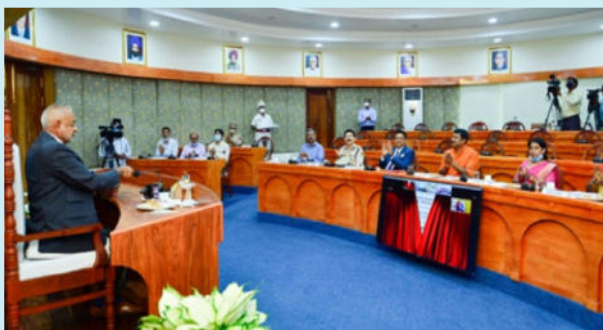
Hon'ble Lt Governor inaugurating the POL Retail Outlets at Baratang & Uttara through virtual mode from Raj Niwas.

With the inauguration of these two outlets, the A&N