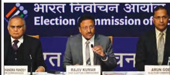
The Election Commission of India (ECI) panel during the press conference on upcoming elections in Nagaland, Meghalaya and Tripura at Akashwani Bhawan in New Delhi, on Wednesday