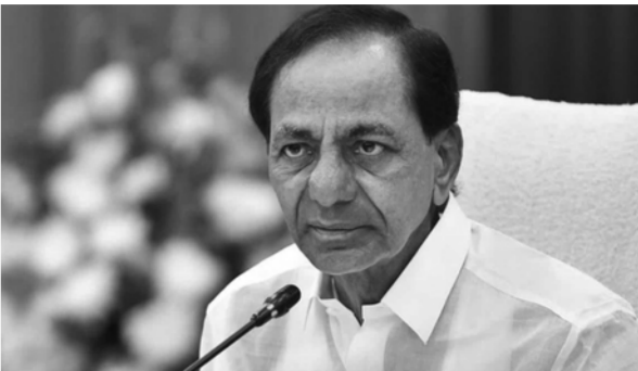
K Chandrashekar Rao

Addressing the first public meeting of Bharat Rashtra Samithi (BRS) here, party chief Rao said free power would be provided to farmers across the country if a 'BRS proposed government' captured power at the Centre in 2024, following polls to the Lok Sabha. "Make in India has