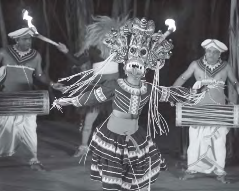
Dancers perform during a cultural dance show to promote tourism in Colombo, Sri Lanka