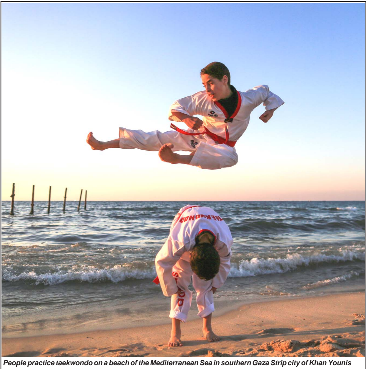
People practice taekwondo on a beach of the Mediterranean Sea in southern Gaza Strip city of Khan Younis