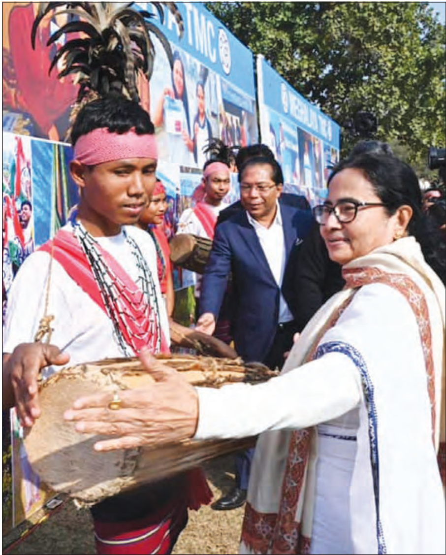
Chief Minister Mamata Banerjee trying her hands on a traditional musical instrument of Meghalaya in the sudelines of her rally in the poll-bound state

SHILLONG, JAN 18 /--/ West Bengal Chief Minister Mamata Banerjee on Wednesday hit out at the BJP, dubbing the saffron party as "double-faced", which says something at the time of elections and does something else after polls. Addressing a public meeting in North Garo Hills district in poll-bound Meghalaya, Mamata asserted that her Trinamool Congress is the only party that can provide better governance in the North-Eastern state, as it fulfils the dreams of people. "BJP is double-faced, it says something during elections and does something else after that. The BJP government at the Centre only gives money to states ruled by the saffron party," she said, urging people to vote for the TMC. Assembly polls will be held in Meghalaya on February 27, the Election Commission announced on Wednesday. "What has this (National People's Party-led) government done in the past five years in the state?