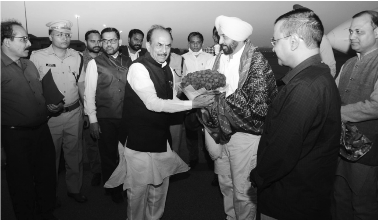
Telangana Home Minister Mohammed Mahmood Ali receiving Punjab Chief Minister Bhagwant Mann at Begumpet airport, Hyderabad

It said that SIMI, through its members, has contacts in Pakistan, Afghanistan, Saudi Arabia, Bangladesh and Nepal and, being an organisation of students and youth, SIMI is influenced and used by various fundamentalist Islamic terrorist organisations operating from Jammu and Kashmir. (PTI)