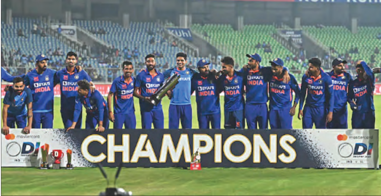
Indian players pose with the trophy after beating Sri Lanka

Skipper Rohit Sharma (42 off 49) and Shubman Gill (116 off 97) opened a fluent 95-run opening partnership before Kohli (166 not out off 110) propelled India to a daunting 390 for five with his 74th international hundred and 46th in the 50-over format. Sri Lanka succumbed to the high quality fast bowling of Mohammad Siraj who struck four times inside the 10 overs to shut the door on the opposition. Sri Lanka were all out for a meagre 73 in 22 overs, highlighting the gulf between the two teams. It is the biggest margin of victory by runs in the history of men's ODIs. The night well and truly belonged to King Kohli. The 34-year-old, who had ended a nearly three-year wait for an international