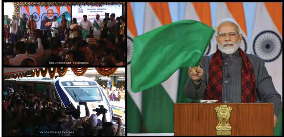
Prime Minister Narendra Modi flags off Vande Bharat Express train connecting Secunderabad with Visakhapatnam via video conferencing on Sunday

The Prime Minister said today traveling by Indian Railway is becoming a pleasant experience. Many railway stations