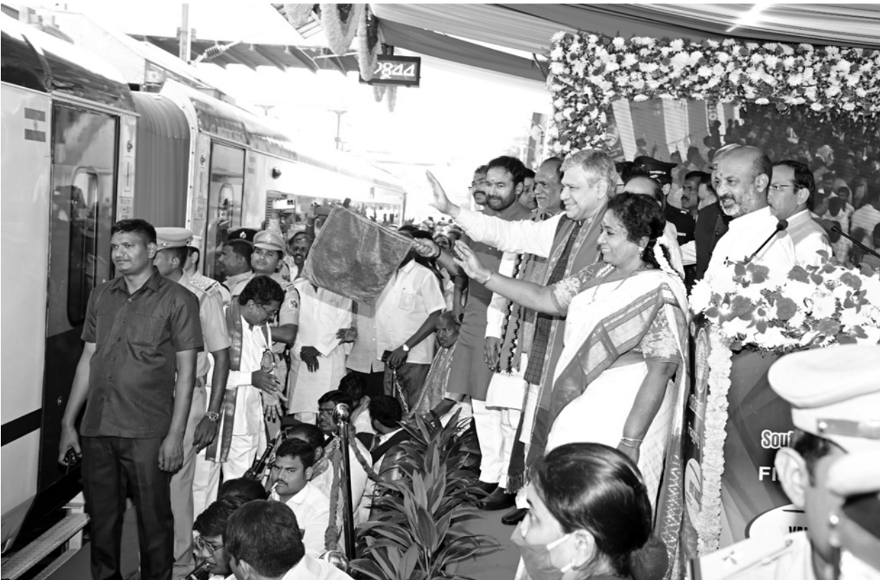
Union Minister for Railways Ashwini Vaishnav, Union Minister for Tourism and Culture G Kishan Reddy at the flagging off ceremony of the Vande Bharat Express train connecting Secunderabad with Visakhapatnam, in Secunderabad on Sunday

NEW DELHI, JAN 15 /--/The Supreme Court is scheduled to hear on Monday a plea seeking the court's intervention to declare the crisis in Uttarakhand's Joshimath as a national disaster. According to the cause list of January 16 uploaded on the apex court website, a bench comprising Chief Justice D Y Chandrachud and Justices P S Narasimha and J B Pardiwala would hear the petition filed by Swami Avimukteshwaranand Saraswati. Joshimath, the gateway to famous pilgrimage sites like Badrinath and Hemkund Sahib and international skiing destination Auli, is facing a major challenge due to land subsidence. Joshimath is sinking gradually with huge cracks developing in houses, on roads and fields. Many houses have tilted and are sinking, locals said. (PTI)