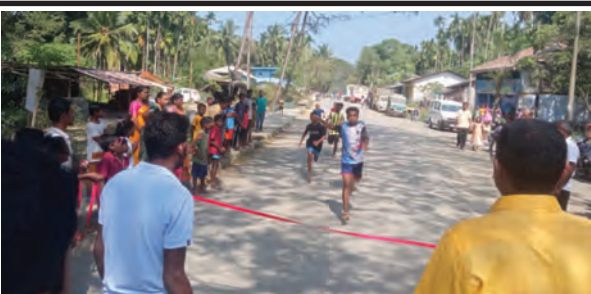
Residents of Rest Camp at Mayabunder celebrated Pongal by organizing a befitting programme. As part of the celebration a number of indoor and outdoor games were conducted. (PIX KARTIK)