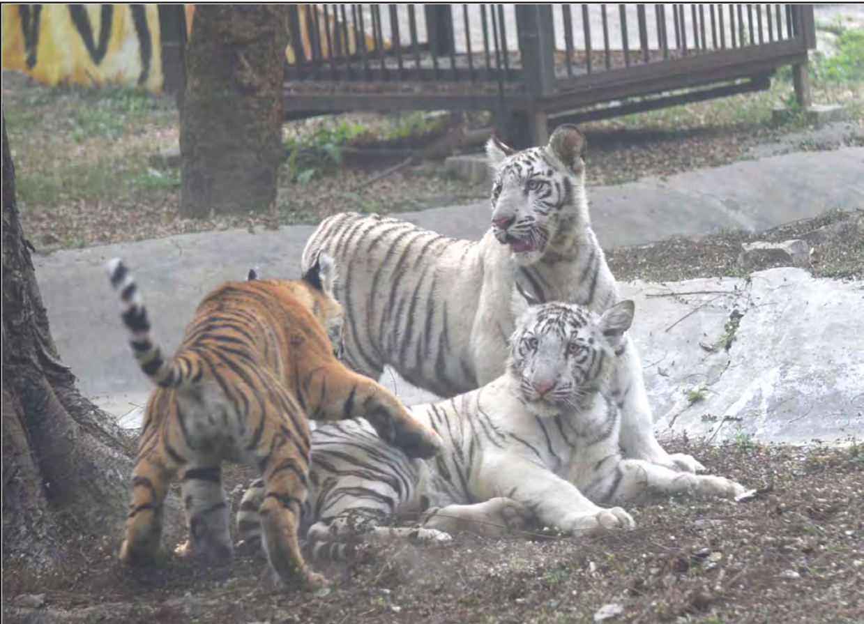
Tiger cubs make his first public appearance at the side of her mother at Sanjay Gandhi National Park in Patna on Sunday

This is not just a symptom of timidity. It points to something deeper, namely the genuine impasse in which world capitalism finds itself today. If the structure of western imperialism as it has evolved over the years is to be kept intact, then the metropolitan countries have to keep the Ukraine war going, in which case inflation at the current pace becomes unavoidable in the absence of an engineered recession, and the consequent unemployment. World capitalism's taking this route therefore should not cause any surprise; the point is to resist it. (IPA)