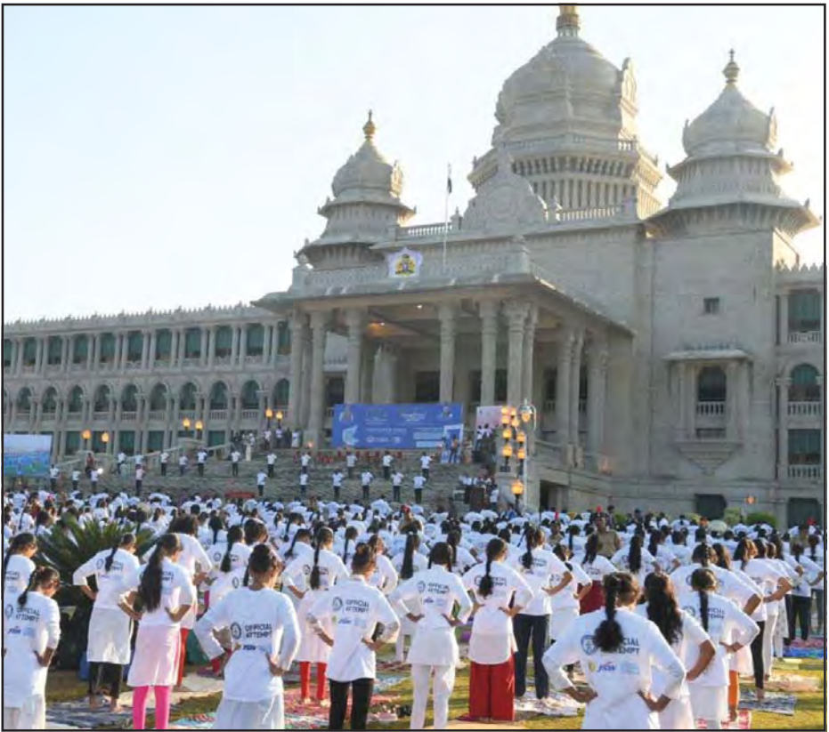
A physically disability person takes a holy dip in the Ganga on the occasion of 'Makar Sankranti' at Sagar Island on Sunday

The train comprises 14 AC Chair Car Coaches and two Executive AC Chair Car Coaches with a capacity of 1,128 passengers. It will provide the fastest travelling facility between these two stations and has exclusive reserved sitting accommodation. (PTI)