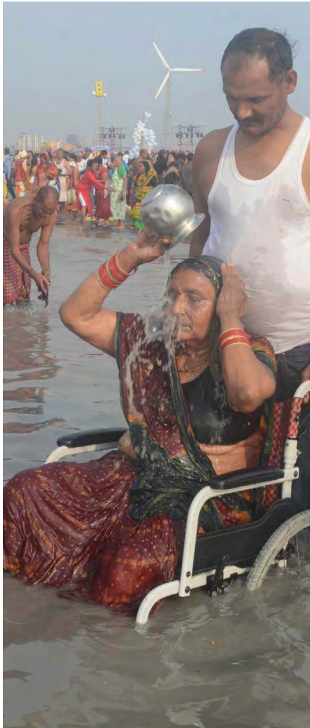
A physically disability person takes a holy dip in the Ganga on the occasion of 'Makar Sankranti' at Sagar Island on Sunday

"Officials have been instructed to coordinate with the Ministry of External Affairs to make arrangements to bring the mortal remains of the deceased people of Uttar Pradesh to the state," the chief minister said in another tweet. (PTI)