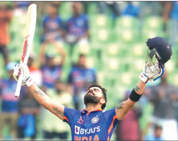
Virat Kohli celebrates after reaching his hundred

452 innings to get to 49 centuries. Before Kohli took over, Gill had played some high quality strokes en route to his second ODI hundred. With that effort, he repaid the faith of the team management which had picked him to open ahead of