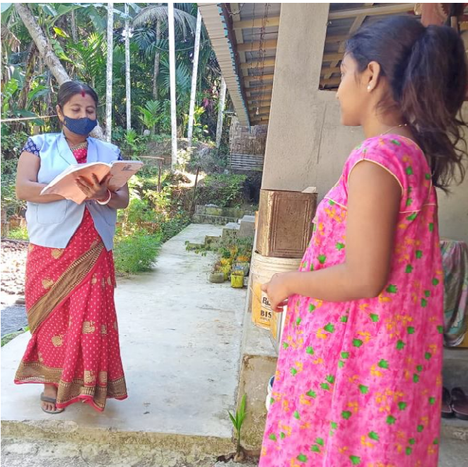
Port Blair, Jan 08:

To tackle the recent surge in the COVID positive cases in South Andaman and to prevent the further spread of the virus, the District Administration has taken various proactive steps. In this connection, distribution of medicines and providing of oximeters to the door steps of all the ILI cases, positive cases and contacts of positive cases is being done.