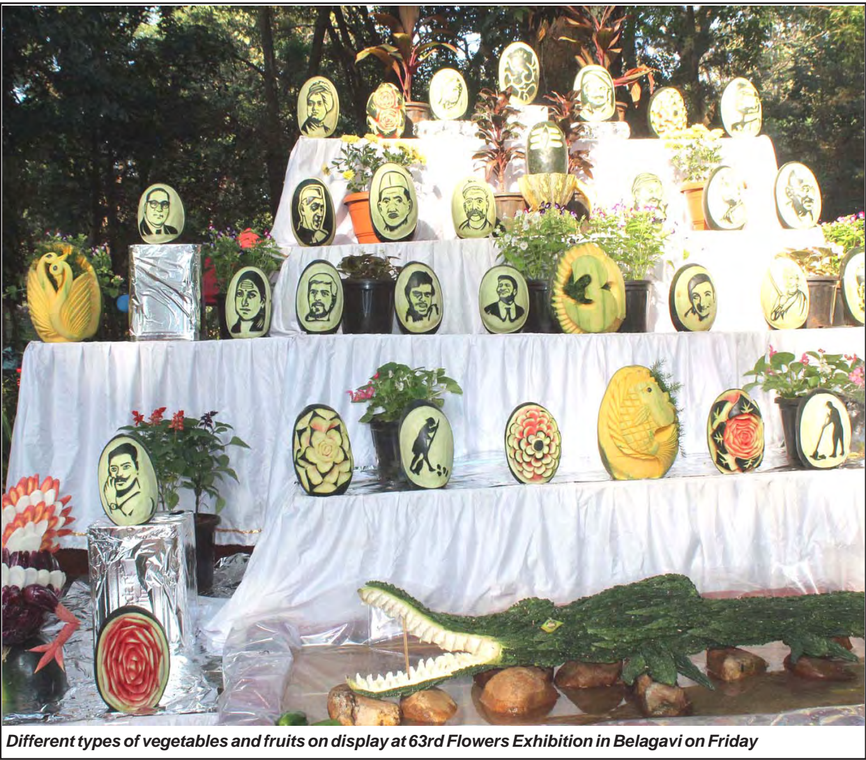
Different types of vegetables and fruits on display at 63rd Flowers Exhibition in Belagavi on Friday

Now, the focus of the ongoing talks have been shifted from “liability or compensation” to “co-operation and facilitation”. Egyptian Foreign Minister Sameh Shoukry, the president of CoP27, has said that compromise is necessary to reach a “conclusive decision”. “This could be the CoP where we lose 1.5 degree Celsius,” said Alok Sharma, the former UK cabinet minister who presided over CoP26 summit in Glasgow last year. (IPA)