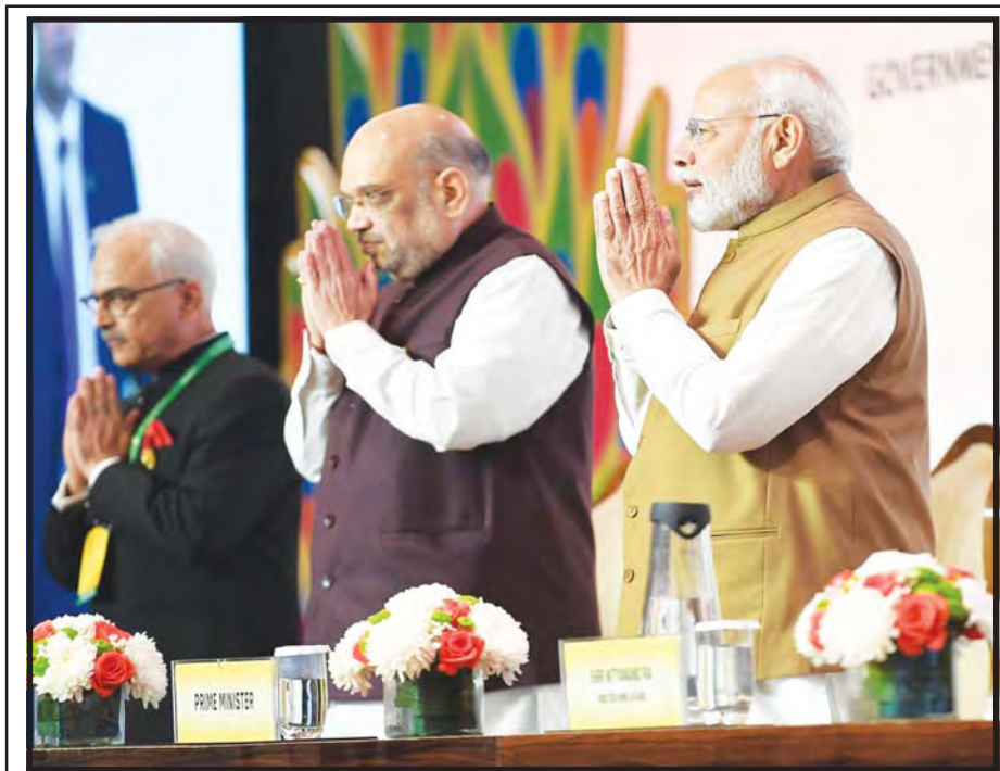
Prime Minister Narendra Modi and Union Home Minister Amit Shah at the third 'No Money for Terror' (NMFT) Ministerial Conference on Counter-Terrorism Financing, in New Delhi on Friday

During the last two decades, India has repeatedly sought inclusion of several Pakistan-based leaders of Lashkar-e-Taiba and Jaish-e-Mohammed leaders in the United Nations Security Council's 1267 committee list but the proposals have been vetoed by China, a permanent member of the Council. "We have seen that some countries protect and shelter terrorists, protecting a terrorist is equivalent to promoting terrorism. It will