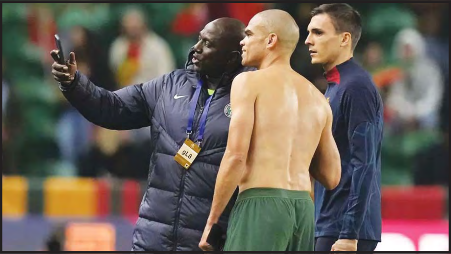
A staff member of the Nigeria team takes a selfie with Portugal's Pepe, centre, at the end of an international friendly soccer match between Portugal and Nigeria at the Jose Alvalade stadium in Lisbon. The Portuguese team will leave for Qatar on Friday for the World Cup

DOHA, NOV 18/-- Portugal finished their final FIFA World Cup preparations with a comprehensive win over Nigeria in the warm-up game at Estadio Jose Alvalade in Portugal. Fernando Santos' men will now fly to Qatar for the FIFA WC. Portugal were without Cristiano Ronaldo who missed the training and the game due to gastritis. The Portuguese still cruised to a 4-0 victory over the Super Eagles, thanks to goals from Bruno Fernandes, Goncalo Ramos and Joao Mario. Manchester United's Fernandes opened the scoring in the 9th