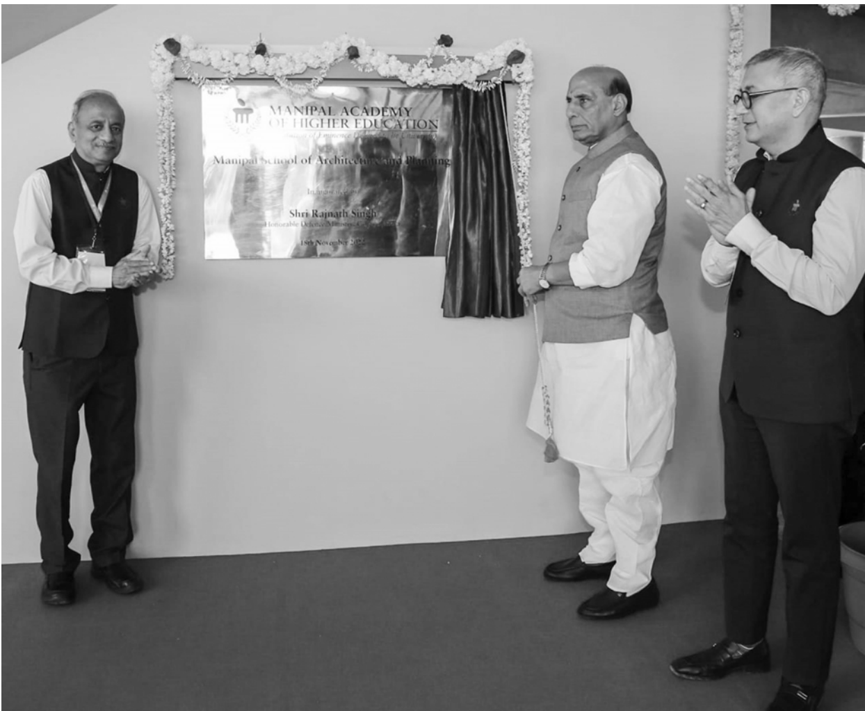
Union Minister for Defence, Rajnath Singh at the convocation ceremony of Manipal Academy of Higher Education, in Udupi, Karnataka on Friday

while Savarkar signed a mercy petition, which is a fact." "Lokmanya Bal Gangadhar Tilak, one of the greatest Indians, was sentenced to six years imprisonment at Mandalay from 1908-14. Tilak did not sign a mercy petition," Ramesh, who is Congress general secretary in charge of the communications and publicity department, said. "We don't want to get into a debate on historical personalities now as the issue needs to be discussed dispassionately and in a scholarly way by sourcing archival material," he said. It was a fact that (Mahatma Gandhi's assassin) Nathuram Godse was influenced by Savarkar. It was Savarkar's ideology that was behind the killing of Mahatma Gandhi. The ideology to which Savarkar subscribed was cause of his killing, the Congress leader claimed. Ramesh said the Congress and the Thackeray-led Sena differed on their views regarding Savarkar, but it will have no bearing on the MVA alliance, in which the grand old party, the Thackeray faction and the Nationalist Congress Party (NCP) are constituents. (PTI)