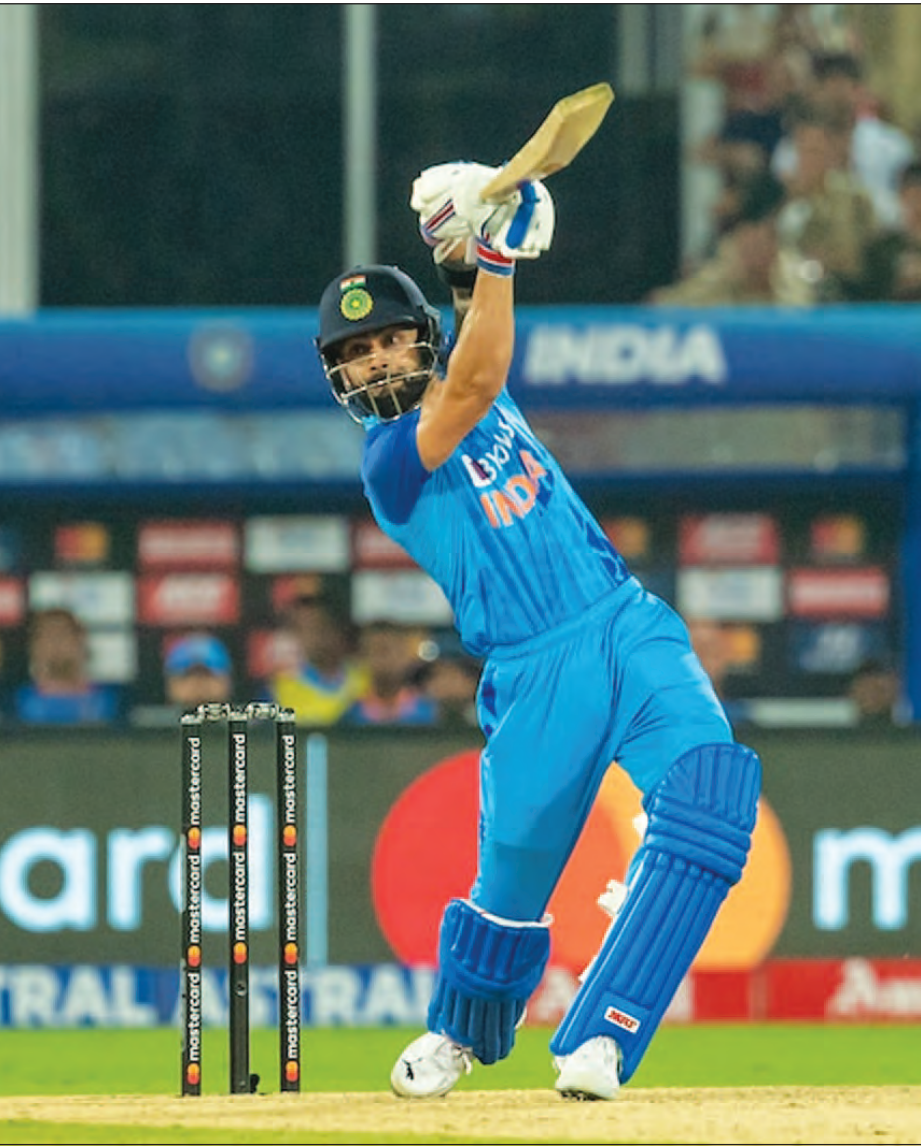
Virat Kohli registered his 33rd T20I fifty on Sunday