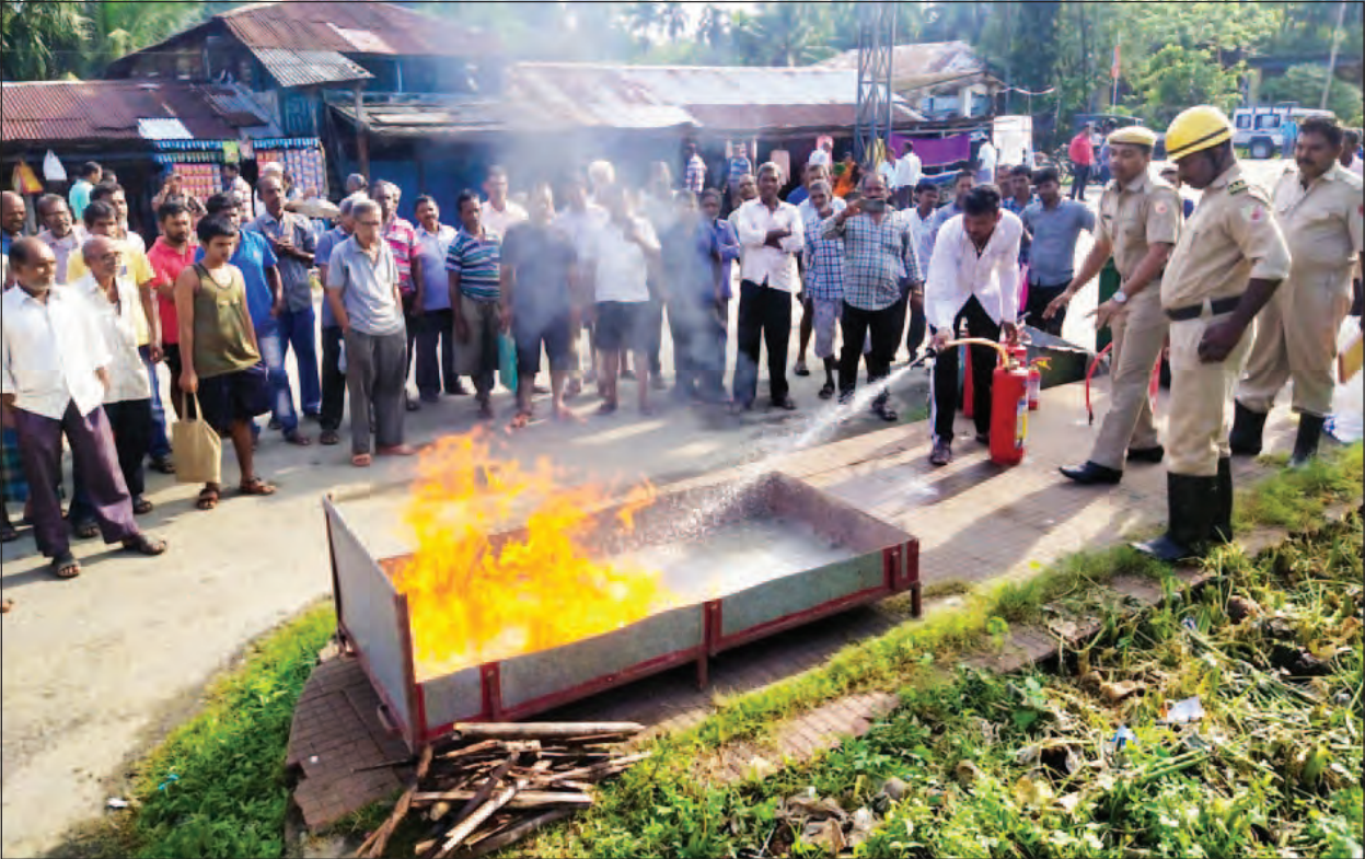
The Bakuntala Fire Service Personnel carried out a mock drill in front of the Durga Puja Committee, Bakultala Durga Puja Pandal.

Though, there are potential negative aspects of casino development, this can be checked by taking necessary safeguards. Formulating a casino policy and establishment of a casino controlling regulatory authority can become the guiding force for running this business.