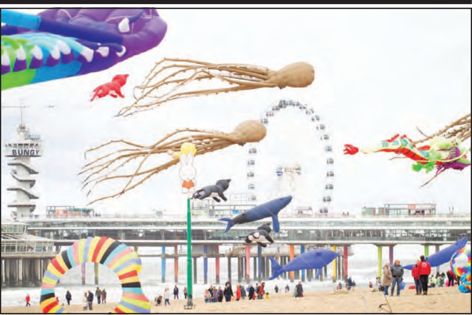
Kites hover above the beach during a kite festival in the Hague, the Netherlands

In response to a question on his meeting with Ukraine's Prime Minister Denys Shmyhal this week on the UNGA margins and what were the concerns articulated by the leader, Jaishankar said "a big concern was the conflict itself. He gave me his perception, his assessment of what was happening in Ukraine". "In terms of India, we had a discussion on what was our position and my sense is that he clearly appreciated the fact that we were against the continuation of the conflict and for the return for dialogue and diplomacy, he said, adding that Shmyhal had his own views on why this was not happening. (PTI)