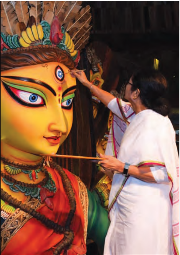
WHEN ART BECOMES WORSHIP: Chief Minister Mamata Banerjee painting the eyes of the idol of Goddess Durga at Chetla Agrani, in Kolkata

The 123-hour-long blockade at Kustaur (in Purulia district) and Khemasuli stations from 4 am on September 20 severely affected train services in Kharagpur and Adra divisions of SER, inconveniencing thousands of passengers every day, the railway official said. Kurmis had first taken to rail and road blockades in West Bengal and neighbouring states on September 20, demanding Scheduled Tribe (ST) status and inclusion of the Kurmal language in the eighth schedule of the Constitution. In Jharkhand and Odisha, however, the blockade of railway tracks was lifted that very day itself, but the protest at the two stations of West Bengal continued. After discussions among Kurmi leaders and government officials, protesters started moving away from Saturday night and cleared the tracks on Sunday morning. Apart from the cancellation of around 295 mail or express and passenger trains since September 20 owing to the agitation, 90 others were short terminated, and 105 were diverted to other routes, the railway official said. (PTI)