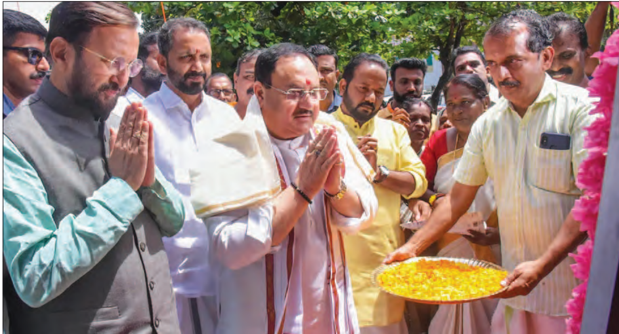
BJP National President JP Nadda with Kerala BJP President K. Surendran, party MP Prakash Javadekar and others pays tribute to Pandit Deendayal Upadhyaya on his birth anniversary, in Ernakulam district