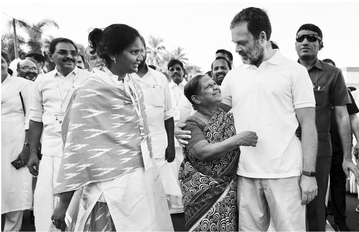
Rahul Gandhi along with other party workers at Bharat Jodo Yatra at Thrissur, Kerala